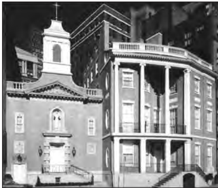
The Shrine of St. Elizabeth Ann Seton on site of former Seton residence, New York City.

You are the first of my children to whom I have submitted a perusal of them, and I request you will return them to