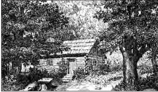
Log Cabin where the Setons stayed for six weeks at Mount St. Mary's College & Seminary.

The property on which the women intended to settle was not in readiness in June and so they rode by their valley farm and went on to the Sulpician settlement on the mountainside. Their first home was a