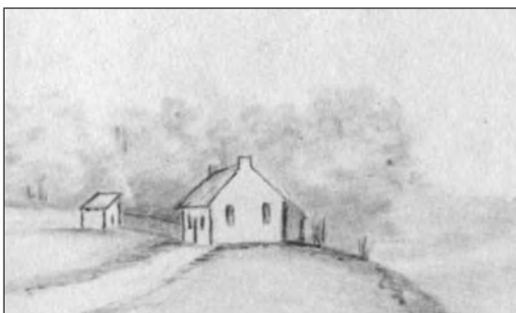
The Stone House in Saint Joseph's Valley where the Sisters of Charity were founded 31 July 1809.