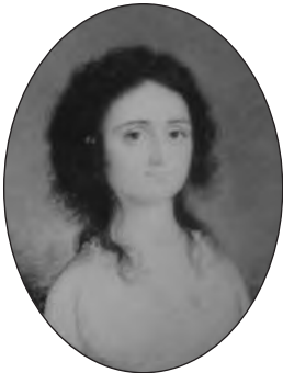
Elizabeth Ann Bayley, Miniature exchanged on Wedding Day.