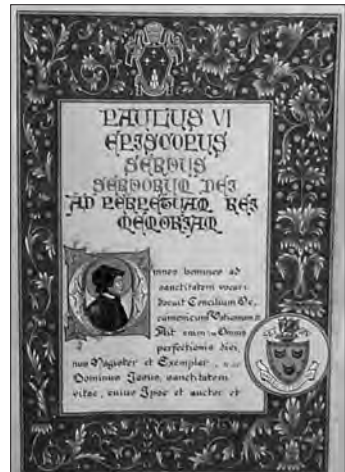
Decree of Canonization of Saint Elizabeth Ann Seton.

Elizabeth inspired her pupils, companions, friends, and associates to become their best selves and to serve God in others. The way she lived her belief in God inspired others to serve their neighbor with kindness and compassion. In so doing the little woman living in the midst of a field in a valley became a model of holiness.