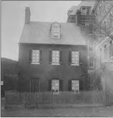
Mother Seton lived in this house on Paca Street, Baltimore.