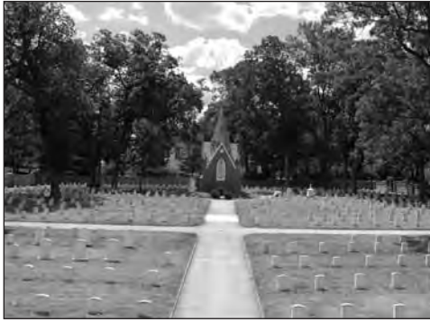
The Mortuary Chapel and Saint Joseph’s Cemetery, original graveyard of the Sisters of Charity, Emmitsburg.