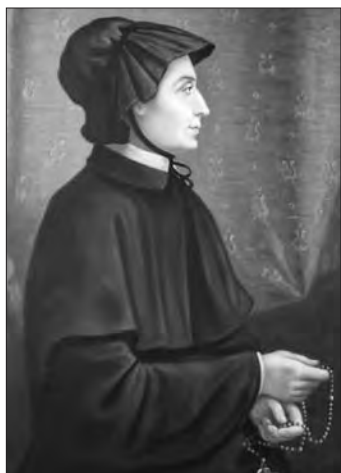
Saint Elizabeth Ann Seton.

Elizabeth was a woman of her time whose legacy is for all times. She was an ordinary woman whose extraordinary ways as wife, mother, and widow, enabled her to parent five children alone, take initiatives, and make life-changing choices because of her convictions. The earthly weaving of the tapestry of Elizabeth's life was strengthened by the warp and woof of both adversity and tranquility. She—