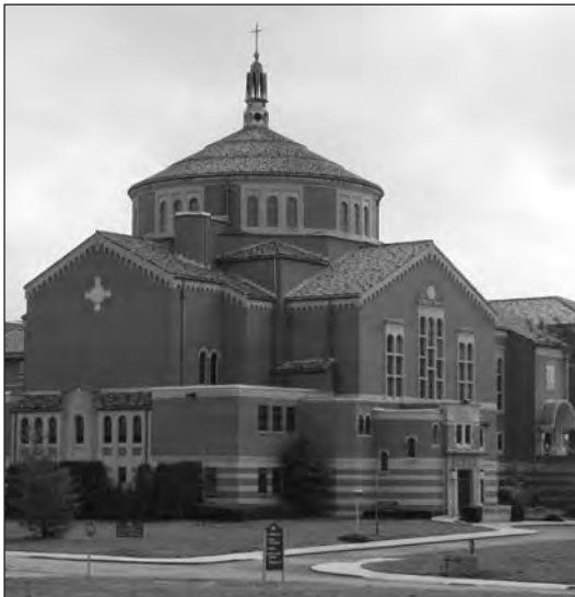
Basilica and Visitor Center of the National Shrine of Saint Elizabeth Ann Seton, Emmitsburg, Maryland.

Elizabeth Seton crafted a mission which reflected "the joy" of her soul "at the prospect of being able to assist the Poor, visit the sick, comfort the sorrowful, clothe little innocents, and teach them to love God!" 35 Her vision of mission and charity on behalf of others has become a lasting legacy of charity. 36 Through words and deeds, she planted seeds of new life and nurtured growth. 37 In educating her students, Mother Seton consistently and conscientiously sought to prepare her pupils for the world in which they were destined to live. 38