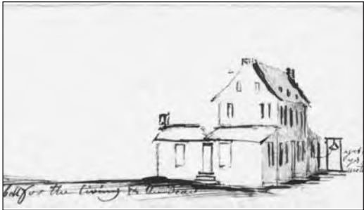
St. Joseph's House, called the White House, where Mother Seton lived 1810-21.

When the community was augmented by two new arrivals from New York, the Stone House literally overflowed, and it became necessary to send some of the sisters to sleep in the house which was being built for their permanent home. This house which is known today as the White House was the original "St. Joseph's House" of the community and served as the first motherhouse and ministry center. h The basic log structure was completed but the plastering remained to be done. Six postulants impatiently awaited its completion so that they might be admitted, 11 but in December Elizabeth told Archbishop John Carroll, "There seems to be no intention of removing us to St. Joseph's i this winter. I have refused to give the least sentiment on the subject, there are so many difficulties in staying and dangers in going that unless obliged in