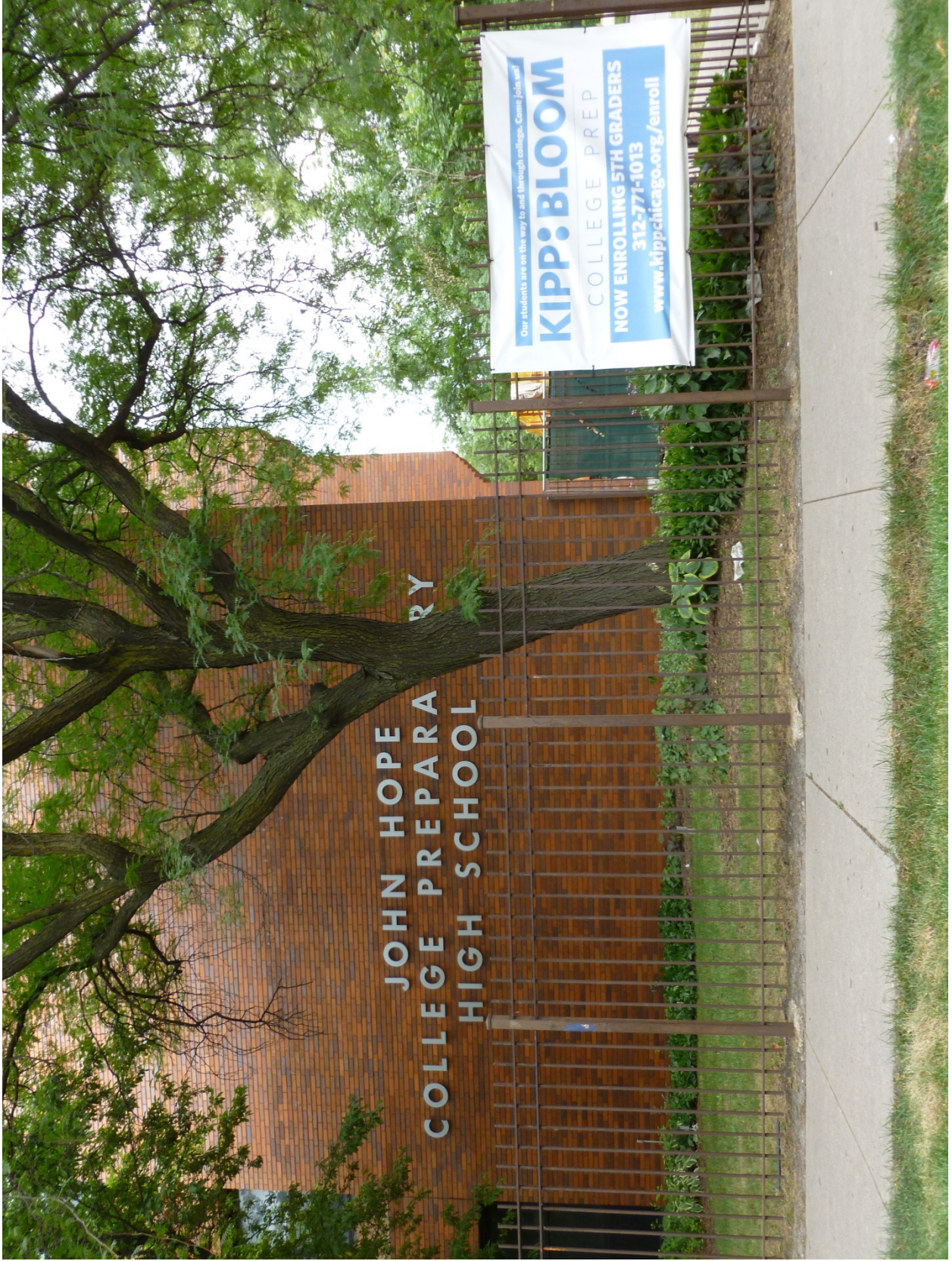
Picture 4: Co-Location John Hope College Preparatory High School & KIPP Bloom