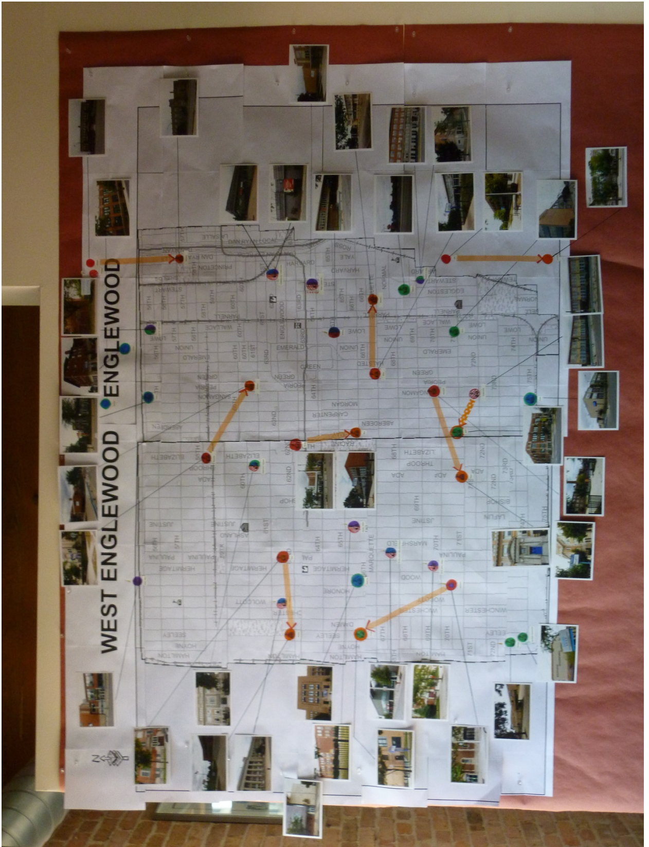
Figure 1: Original Wall Map Analysis