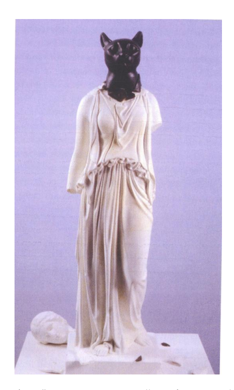
Fig. 12 "Artemis/Bast" in Patanta Rei: A Gallery of Ancient Classical Art, 1992

white ownership of black slaves were reified and rendered 'natural' by the laws of the land" (Harris, 1993, p. 2). From this perspective, museum culture continues to endorse white privilege through visual archive, ignoring resources essential to new cultural narratives.