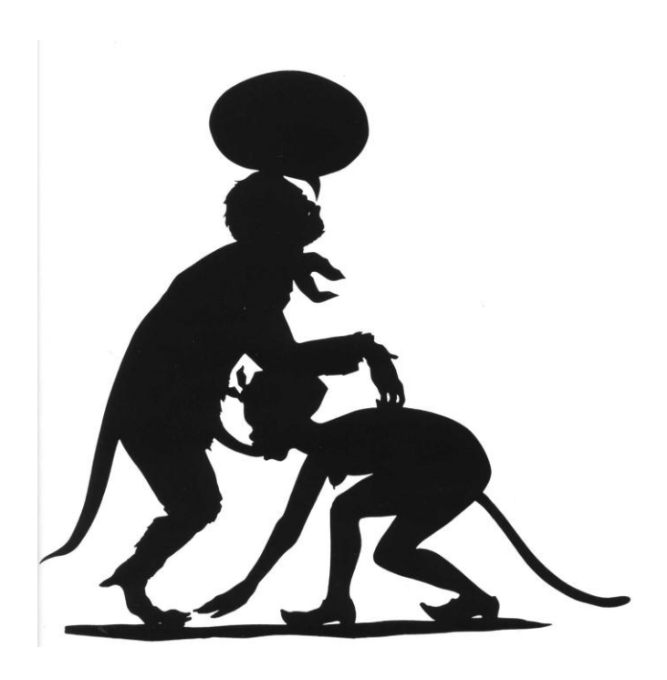
Fig. 3 "Successes" 1998 Cut Paper and Adhesive on Wall

desire and sexual violence, utilizing dialectical imagery that invert Western myths to articulate colonial domination. Walker comments," I was trying to make up mythology and deconstruct it at the same time" (as cite in Dixon, 2002, p. 14.). Walker's work, the reoccurring motif of the mating of a black girl and a swan develops into a potent symbol of blackness and their fusion through sexuality" (Dixon, 2002, p. 14). Through the allegorical expression of mythological themes, Walker's narratives parallel Benjamin's approach dialectical imagery, harnesses the dynamic power of these archetypes to promote change in the way identity is formed within our social collective consciousness.