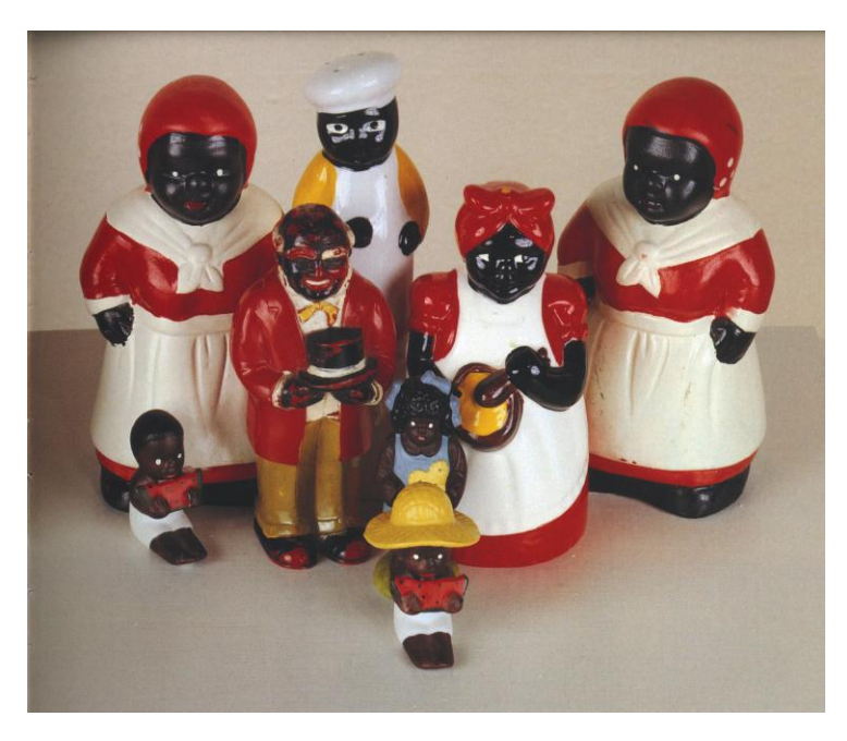
Fig. 13 "Mine/Yours" 1995 Painted Ceramic

Wilson's 1995 exhibition, "Collectibles," (Fig. 13) examined the circulation and distribution of black commodities in present day culture. The Mammy, Uncle Tom and Aunt Jemima collectables are beautifully hung and sold in gallery and museum gift shops throughout America. Many of these popular stereotypes border on the kitsch as well as derogatory representations of the past. The artist discussed the role these collectibles play as commodities. Wilson observed that African Americans have a peculiar relationship with these kitsch items. Wilson noted that we collect these representations of stereotypes as a way of remembering our ignominious past: However many African Americans collect Mammy and Uncle Toms to symbolically reanimate and to kill them. Some collectors believe that by owning these items that they can reclaim their power over them, yet the very act of collecting can spur on a economy around these