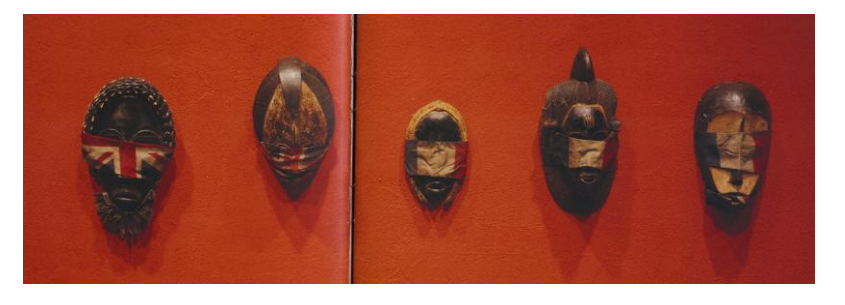
Fig. 10 "Colonial Collection" 1990

Wilson's technique of juxtaposing video with appropriated images is effective in exposing power structures within museum. Wilson's strategies of resistance coincide with Foucault's theories on power. According to Foucault, power is pervasive in all societal encounters and relationships. From bureaucratic systems to interpersonal negotiations, power regulates our behavior and the way we communicate with others. Institutions enforce norms that reflect the interest of the dominant culture. Wilson enacts strategies to confront cultural impositions in museum culture. Wilson's critical assessment of museums continued with his 1990 "Colonial Collection" (Fig. 10).