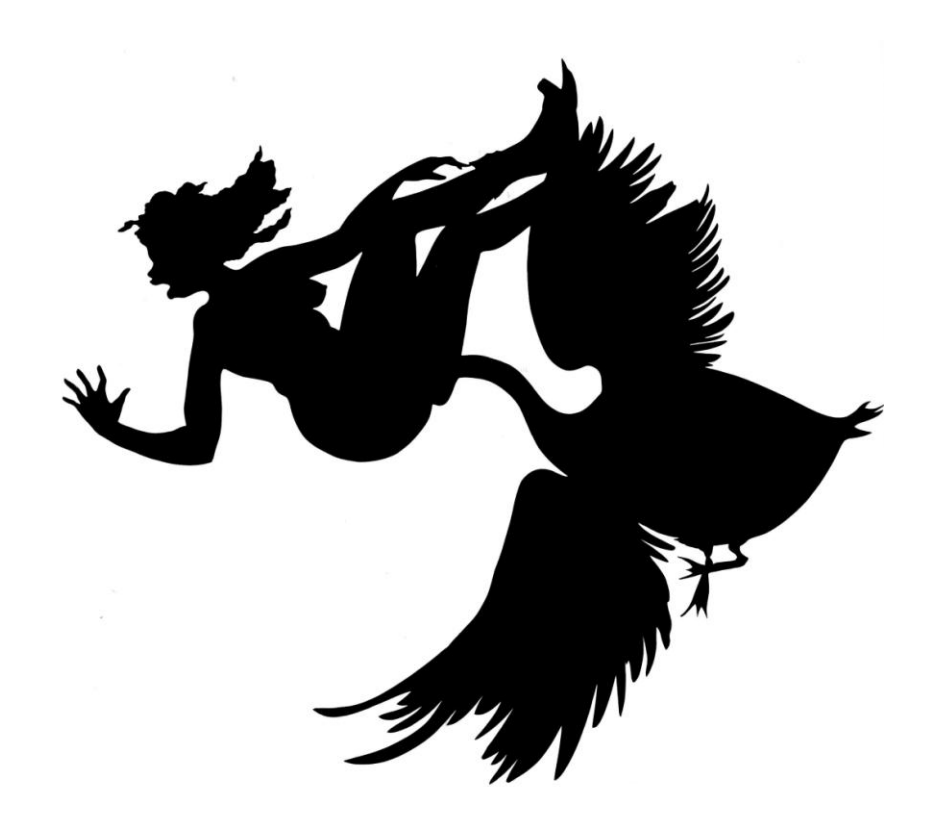
Fig. 2 "An Abbreviated Emancipation" (from The Emancipation Approximation) (detail) 2002, Cut Paper and Adhesive on Wall

In Walker's tableau, dialectical images allude to archetypes, where humans transmute into animals forms, transforming ideological compilations into tragic myths. The artist incorporates swan in her narratives, which are symbolic of desire and hybrid identities. "An Abbreviated Emancipation" (Fig. 2) a panel from a series, titled The Emancipation Approximation depicts a swan impregnating a black woman consumed with passion, evoking theme of miscegenation and symbolic of the forbidden entanglement between self and other. Negress consumed with passion becomes entangled with the swan. The impact of sexual assault is so powerful that it excites an onlooker in the tableau. Walker is retelling of the Greek of Myth Leda and the Swan – a story about