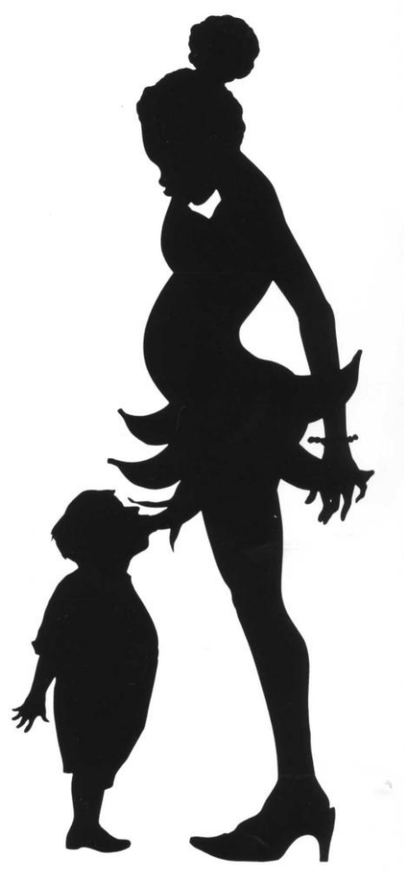
Fig. 6 "Consume" 1998 Cut Paper and Adhesive on Wall

Freud's perspective of the destabilizing nature of ego and body manifestations reaffirms Walker's psychosomatic insights, as well as Fanon's psycho-existential views on racial epidermization.