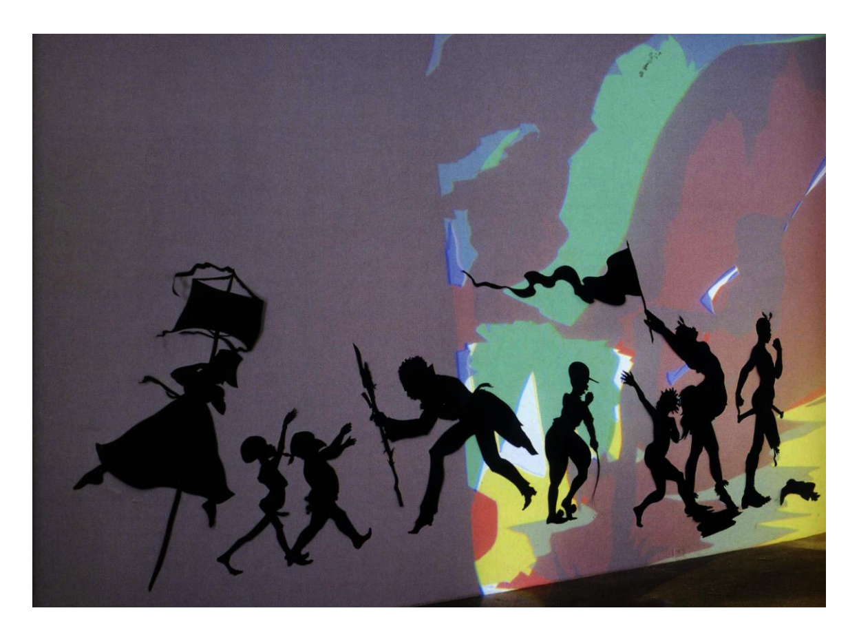
Fig. 1. "Darkytown Rebellion" 2001 Cut Paper and Projection on Wall

In this section, I will examine Walker's art from the theoretical perspectives of Benjamin, Fanon and Freud and discuss how her visual narratives based on slave references challenge traditional notions of blackness, which inform identity and difference. Viewers approach the installation by walking from a brightly lit gallery through a dark narrow passage, which leads into a panoramic hall where the life size silhouettes are projected across a