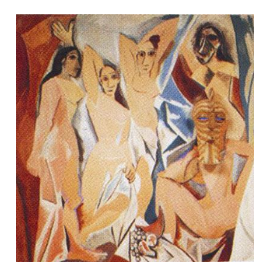
Fig. 9 "Picasso: Whose Rules?" in Primitivism High and Low, 1991

resembling tribal masks. Despite sexual references to a brothel scene, Picasso's portrayal of their facial appearance was disturbing and controversial.