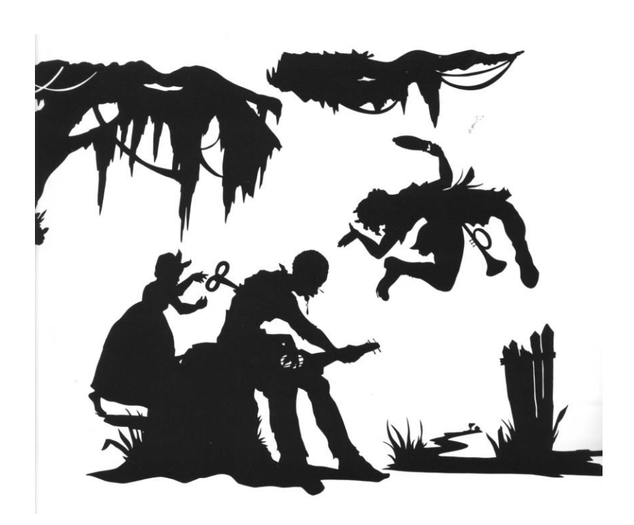
Fig. 7 "Presenting Negro Scenes Drawn Upon My Passage Through the South and Reconfigured for the Benefit of Enlightened Audiences Wherever Such Mat Be Found" 1997 Cut Paper and Adhesive on Wall

Walker's aesthetic exploration exposes primitive discourse as well as the psychosomatic expressions of racism, thus providing new insights on blackness and creativity.