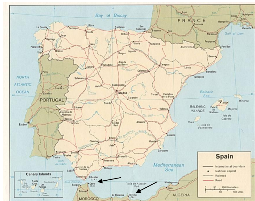
Map 2 - Spain (with Ceuta and Melilla enclaves)

Following on the footsteps of the previous chapter, this section outlines national immigration laws and legalization acts introduced by the Spanish government in the period 1985-2010. First, I focus on legal documents, which are divided into three time periods: the 1980s, the 1990s, and the 2000s. Similarly to my chapter on the EU policy developments, I follow each subsection by a summary of activities undertaken in each decade. My objective is to shed light on Spain's alignment with EU objectives and the degree of influence that the EU has exercised on the Spanish government since the mid-1980s.