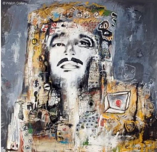
America is Grey

peoples land other peoples territory and trying to occupy that at the same time your demonizing the people who are fighting for there own land. You can look at it in different ways or both ways I'm just stating my opinion.