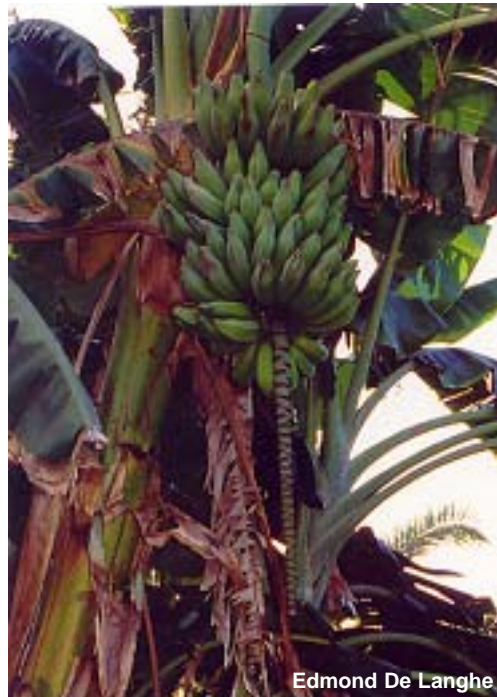
Edmond De Langhe

Photo No. 029 Indian manager of a farm in Batinah region, in front of a monoculture of 'Negal', ABB 'Ney Mannan'. Bunches (and buds) are rather small, due to moderate pruning, but are numerous and marketable at Muscat.