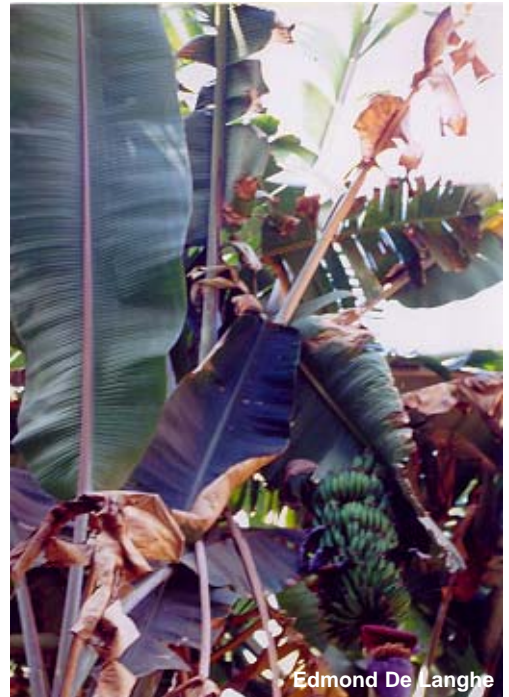
Photo No. 021 The shiny and massive pseudostems of 'Mohammed Ali', AAB 'Mysore' at Banana Island on the Nile.