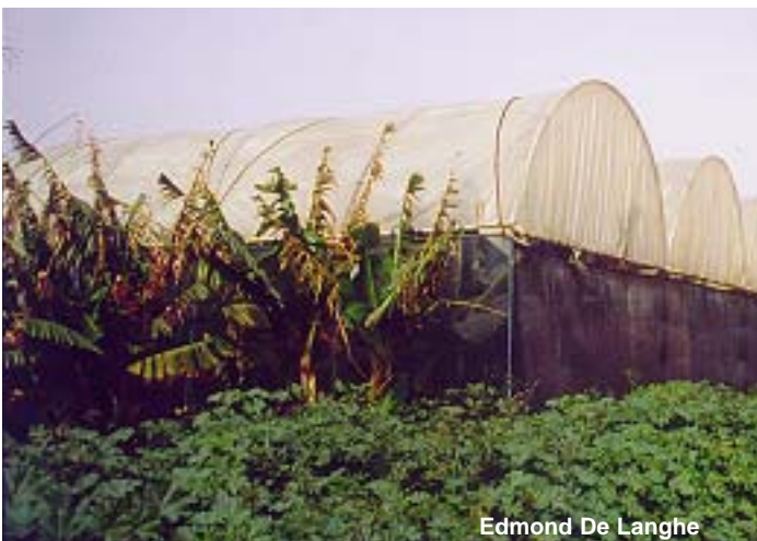
Edmond De Langhe

Photo No. 003 A slightly taller, 'Williams'-looking mutation in a 'Grande naine' field from in vitro propagated plants.