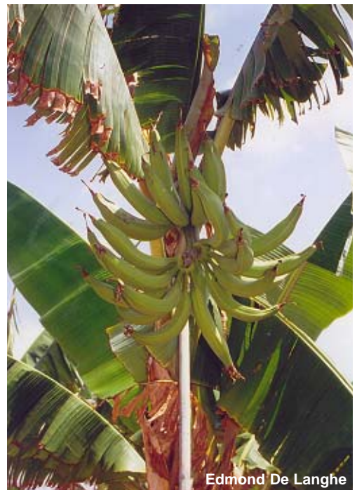
Photo No. 023 The Banana Field Collection at Salalah Agricultural Research Station.