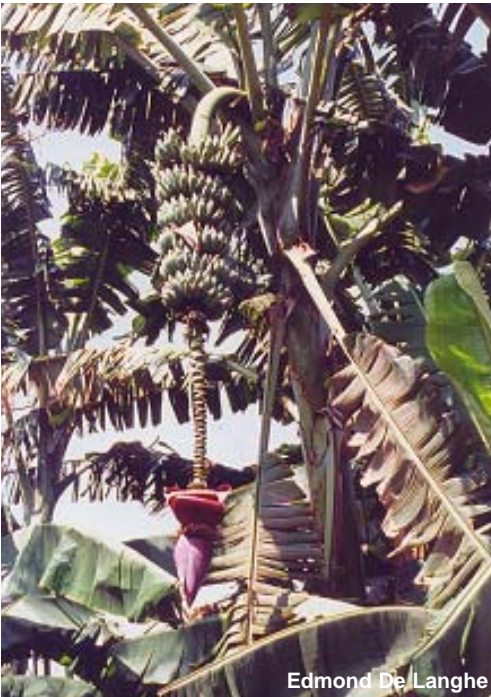
Edmond De Langhe

Photo No. 010 The long pedicels of 'Sindhi' fingers, not merging at their base in a 'cushion'.