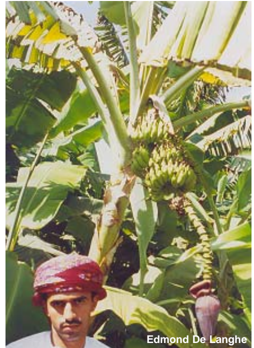
Edmond De Langhe

Photo No. 025 'Kunnan' introduced from India in the collection and probably the correct semi-dwarf ABB 'Kunnan'.