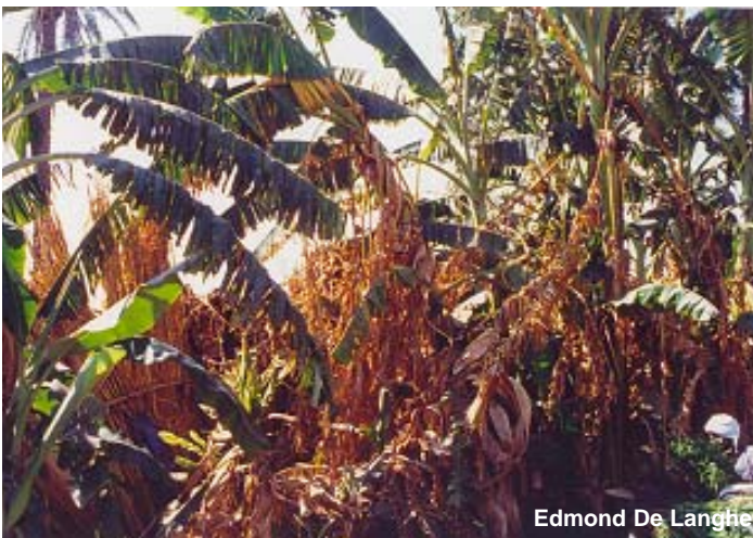
Photo No. 019 'Sindhi', ABB 'Ney Mannan' protecting the residence of a farmer (bottom-right).