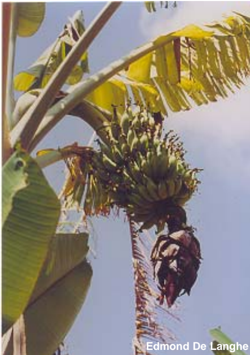
Edmond De Langhe

Photo No. 025 'Kunnan' introduced from India in the collection and probably the correct semi-dwarf ABB 'Kunnan'.