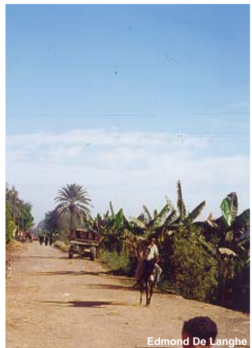
Photo No. 020 'Sindhi' as the only variety in a village of the South, along a primary irrigation canal.