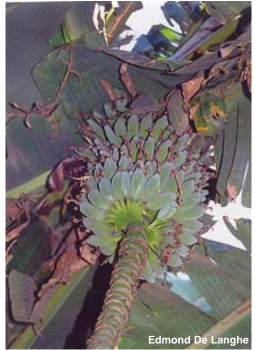
Photo No. 018 A somaclonal variant of ABB 'Pisang awak' near Qena.