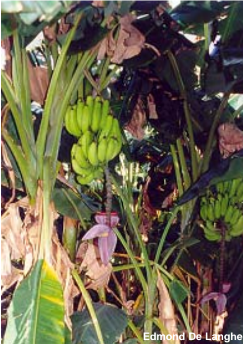
Edmond De Langhe

Photo No. 029 Indian manager of a farm in Batinah region, in front of a monoculture of 'Negal', ABB 'Ney Mannan'. Bunches (and buds) are rather small, due to moderate pruning, but are numerous and marketable at Muscat.