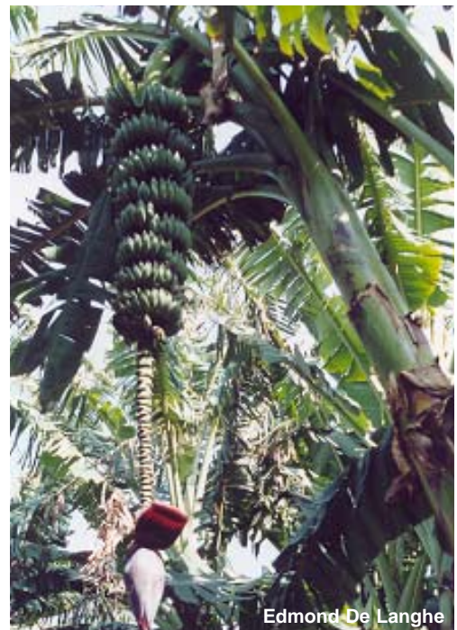
Edmond De Langhe

Photo No. 011 'Baradika', ABB 'Pisang awak'.