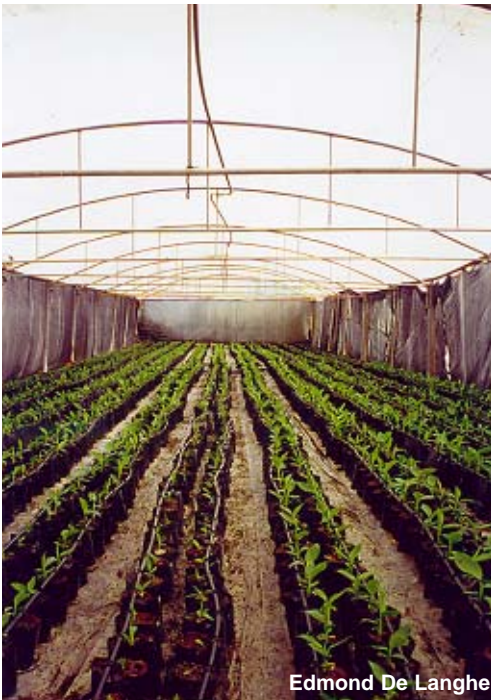
Edmond De Langhe