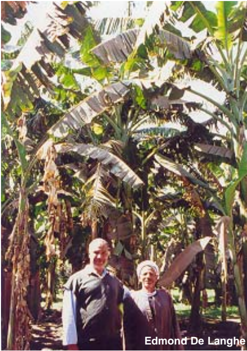
Photo No. 017 Monoculture of 'Baradika', ABB 'Pisang awak'.