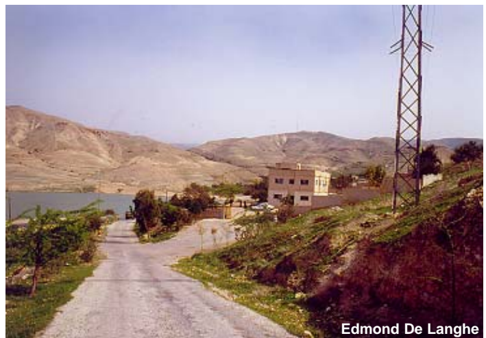
Edmond De Langhe