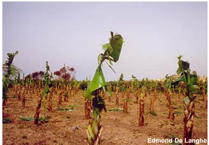
Edmond De Langhe