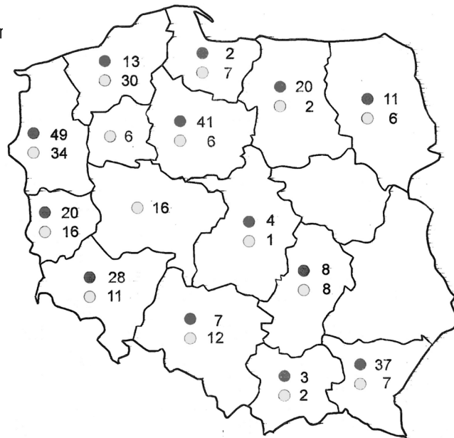
Figure 1. Number of common yew sites ( Taxus baccata L.) in Polish forests. The boundaries are those of forest directorates. Dark circles denote the number of naturally regenerated sites, light circles artificially regenerated sites.

Fungal diseases of common yew are poorly understood. Little research has been undertaken in this area, as yew is a healthy, decay-resistant and strictly protected species. Damping off, dieback of needles and shoots injured by late frosts, and wood rots of old trees are the most common form of damage.