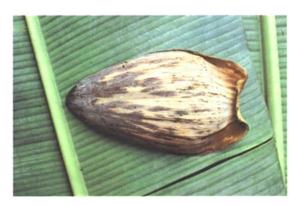
Fig. 3. Conspicuous mosaic in a bract caused by BBMV.