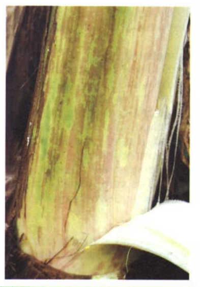
Fig. 4. Large, dark coloured stripes underneath a dead leaf sheath, caused by BBMV (Dr L. Magnaye, BPI, Davao City)