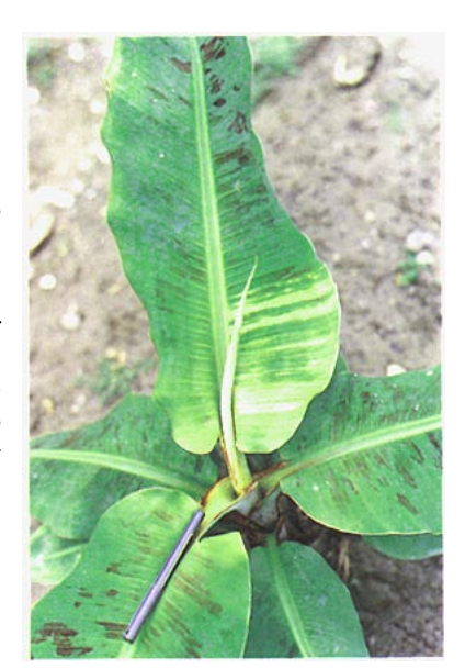
Fig. 10. Mild symptoms of CMV infection.