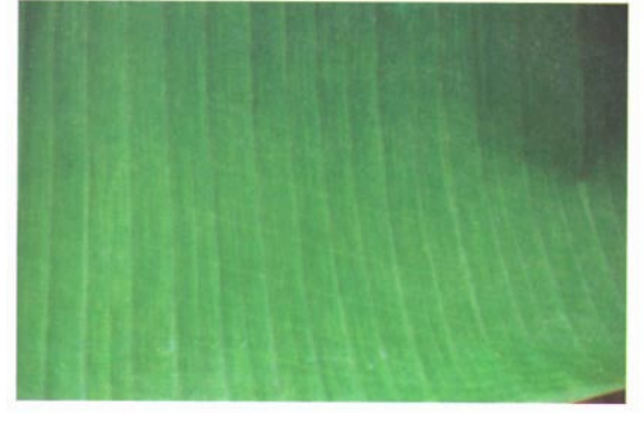
Fig. 5. Subtle chlorotic streak and raised vein symptoms of BBMV on a leaf of Cardaba (ABB/BBB)