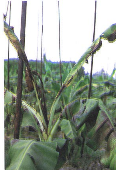
Fig. 11. Severe symptoms of CMV infection, including leaf distortion.