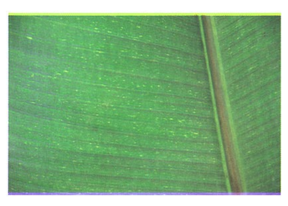
Fig. 13. Discrete leaf symptoms associated with BSV on the plantain hybrid TMP x 548-9 consisting of whitish to yellow flecks.