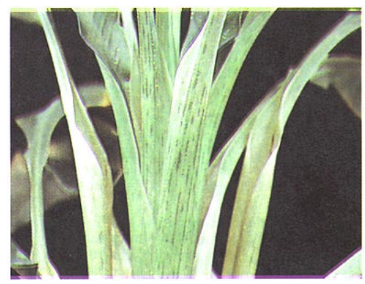
Fig. 6. Dark green streaks on the petiole caused by BBTV.

Note: new records which were not in the 1989 guidelines are printed in bold; * = unconfirmed (this status conferred by the quoted author).