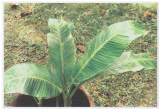
Fig. 2. Dark green mottling on banana petioles caused by abaca mosaic virus. (Dr L. Magnaye, BPI, Davao City)

Fig. 1. Mosaic symptoms caused by abaca mosaic virus. (Dr L. Magnaye, BPI, Davao City)