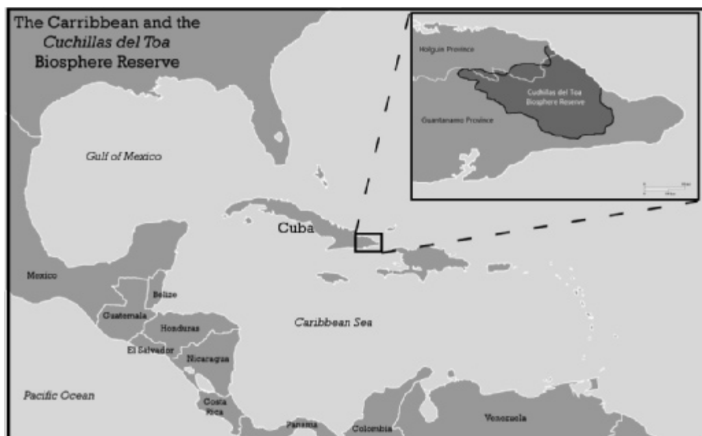
Figure 1: Location of Cuchillas del Toa Biosphere Reserve

Cuchillas del Toa Biosphere Reserve is an important reservoir of genetic material of many fruit and horticultural species and varieties that are currently under threat within the larger, more intensive agriculture systems elsewhere in Cuba. This reserve has been chosen for testing the indicators of resilience as it contains a large area of agricultural landscapes, a large number of farm families, and covers the full range of agroecosystems found in Cuba. The communities living in the buffer and transition zones of the Reserve practice traditional conuco and home garden cultivation in close association with natural landscapes that maintain major components of the total biodiversity.