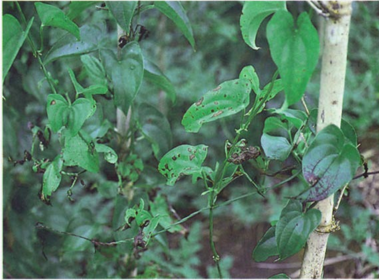
Fig. 4. Leaf spots and dieback on vines: symptoms of yam anthracnose by Colletotrichum gloeosporioides . (Dr. G.V.H. Jackson, South Pacific Commission, Nouméa)