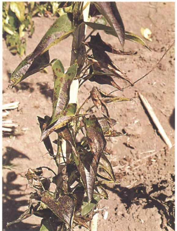
Fig. 5. Leaf blackening, a symptom of yam anthracnose on mature leaves caused by Colletotrichum gloeosporioides (Dr. G.V.H. Jackson, South Pacific Commission, Nouméa)