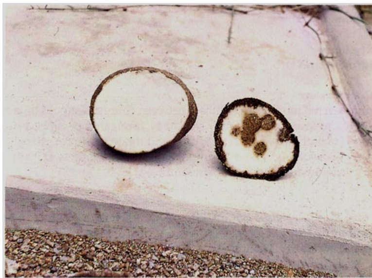
Fig. 6. Dry rot beneath skin on tuber of Dioscorea rotundata caused by Scutellonema bradys (the tuber on the left is healthy).