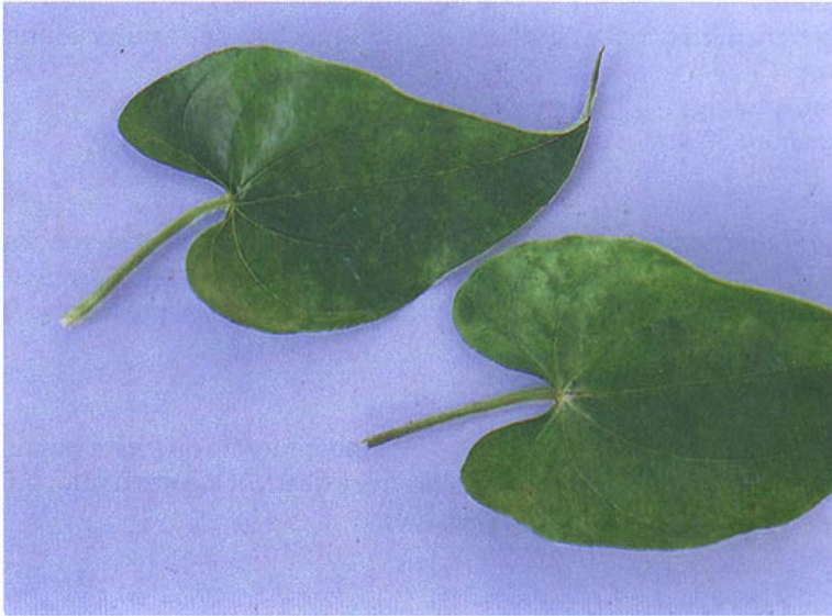
Fig. 1. Symptoms of Dioscorea alata virus. (Dr. H.W. Rossel, IITA, Ibadan)