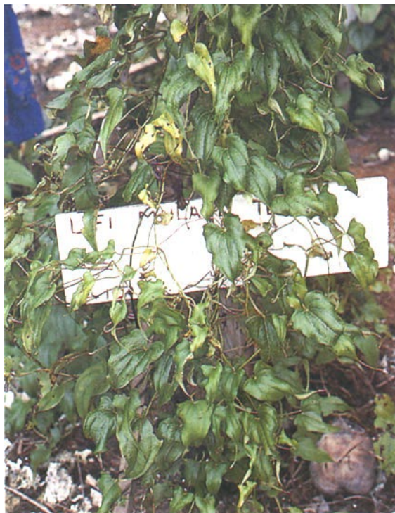
Fig. 2. Yellowing tapered leaves, characteristic of infection by yam mosaic virus on near mature plants of Dioscorea alata .