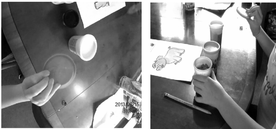
Figure 1: A multi-camera video frame still demonstrated from a participant

To analyse the data, the files were integrated to produce a multi-camera view of the video (Figure 1) using Final Cut Pro (Version 7.0.3). Time points were synced according to the beginning and end participant claps. Prehension patterns that lasted for more than one second (as suggested by Asteriadis et al., 2010) and resulted in at least three DOF (as identified by the researcher), were recorded alongside the time code on the stand-alone camera. A DOF was categorised when a grasp instance had an observable change in flexion/extension or abduction/adduction within the compass of the hand, with no minimal threshold of movement value set. Directional forces applied by the grasp instance were visually interpreted by the researcher and only the dominant hand was analysed. Definitions and classifications are detailed in Table 2.