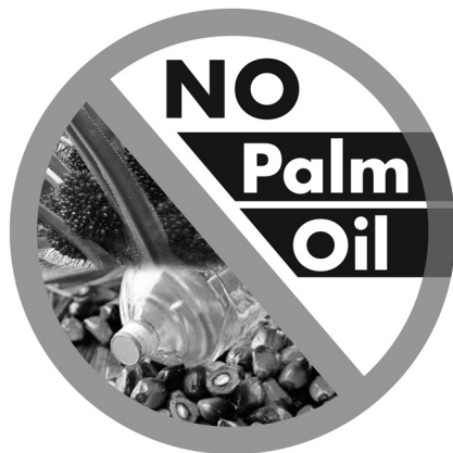
Figure 1. 'No palm oil' campaign.

Despite establishment of the Code of Conduct and government and industry commitments to sustainability, a number of NGO and other organisations have led a sustained, often vitriolic, campaign against palm oil and oil palm cultivation based on five major factors; environmental degradation, biodiversity loss, GHG emissions, social effects and health impact. In this article, we address these factors in turn, hoping to contribute to a more balanced, nuanced and productive discussion on the future of the crop and to promote collaboration to develop common goals for future development.