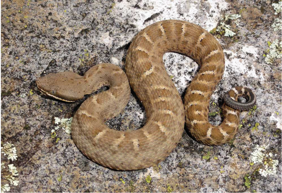
Figure 5. Crotalus willardi. Sierra del Nido, Chihuahua.

Holbrookia elegans , H. maculata , Phrynosoma cornutum , P. modestum , Sceloporus bimaculosus , S. clarkii , S. consobrinus , S. cowlesi , S. jarrovi , S. merriami , S. poinsettii , S. slevini , S. virgatus , Urosaurus ornatus , Uta stansburiana , Plestiodon callicephalus , P. multivirgatus , P. obsoletus , P. tetragrammus , Aspidoscelis exsanguis , A. gularis , A. inornata , A. marmorata , A. sonorae , A. tessellata , and A. uniparens ). Only one of the 51 lizard species that occur in Chihuahua is an introduced species ( Hemidactylus turcicus ).