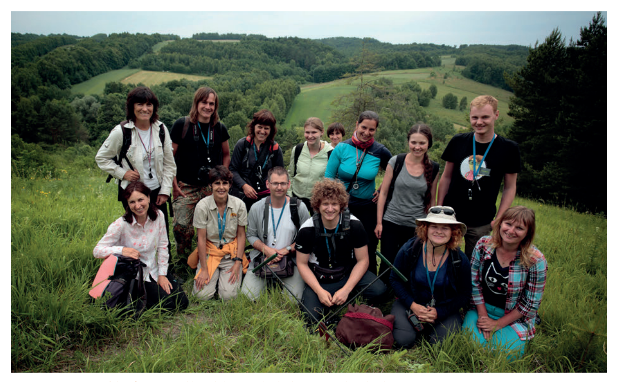
Figure 1: Participants of the 8<sup>th</sup> EDGG Field Workshop in Poland. Slika 1: Udeleženci 8. terenske delavnice EDGG na Poljskem.