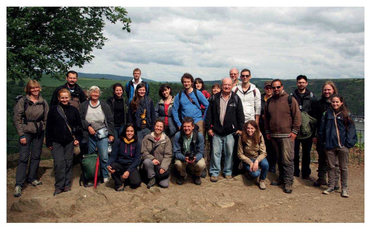
Figure 2: Participants of the Middle Rhine Valley Excursion within the 12th European Dry Grassland Meeting in Mainz, Germany.

Slika 2: Udeleženci ekskurzije v dolino reke Ren med 12. konferenco EDGG v Mainzu v Nemčiji.