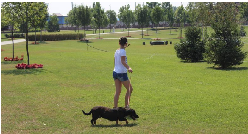
Figure 5. Green area in the place of the former Kavicsos Lake in Mezőkövesd

The analysis of the potential utilisation of the greenfield areas (table 3) clearly shows that there are many more investment plans formulated in comparison with those based on brownfield areas. This fact is rather surprising in the light of the fact that the strategies of almost all settlements mention the need to utilise the brownfield areas, and some of the documents even state that they should be given a priority over greenfield investments. In the background of this contradiction we can probably find the fact that a new settlement part that was not used earlier is more attractive to investors than a brownfield area, and this fact is also reflected in the detailed settlement development concepts.