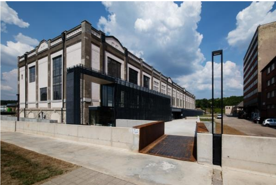
Figure 4. The National Film History Theme Park established on the area of the former Metallurgical Works of Ózd