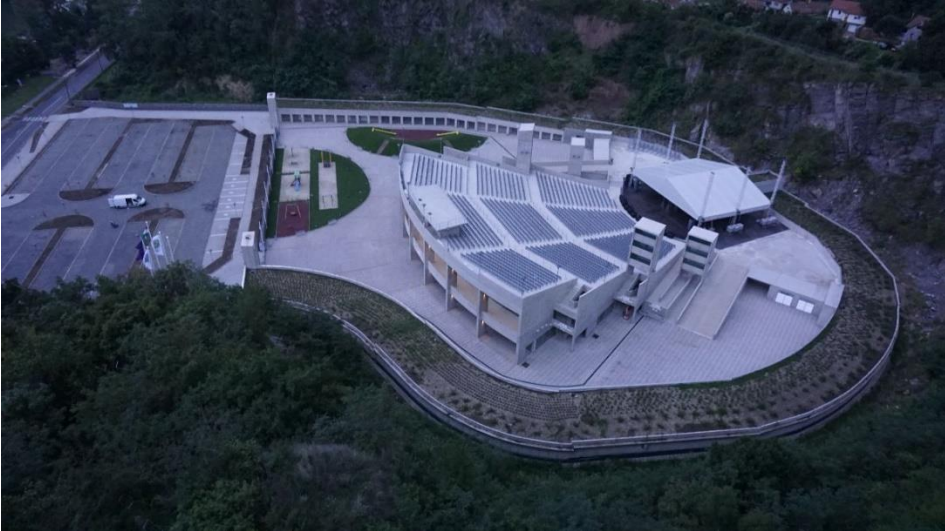
Figure 3. The Festival Cauldron established in the area of the former stone quarry in Tokaj

settlement. Some examples for such developments in this group that were actually realised include the Festival Cauldron established in the area of the former stone quarry in Tokaj (figure 3), the National Film History Theme Park in Ózd (figure 4), and the Science Museum and Art Centre in Miskolc (the latter facility was completed, but was not eventually opened yet).