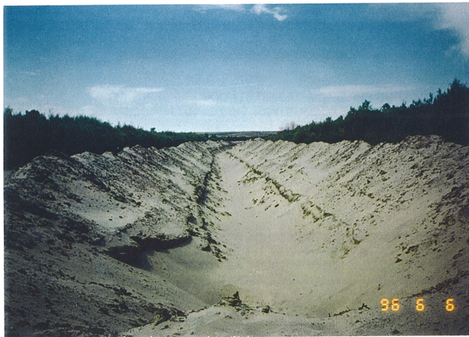
San Marcial, New Mexico Looking south at completed excavated trench in the middle of the tiffany plug. June 6, 1996