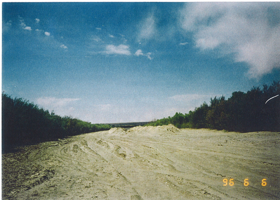
San Marcial, New Mexico Looking south at the start of the tiffany plug, center of the river. June 6, 1996