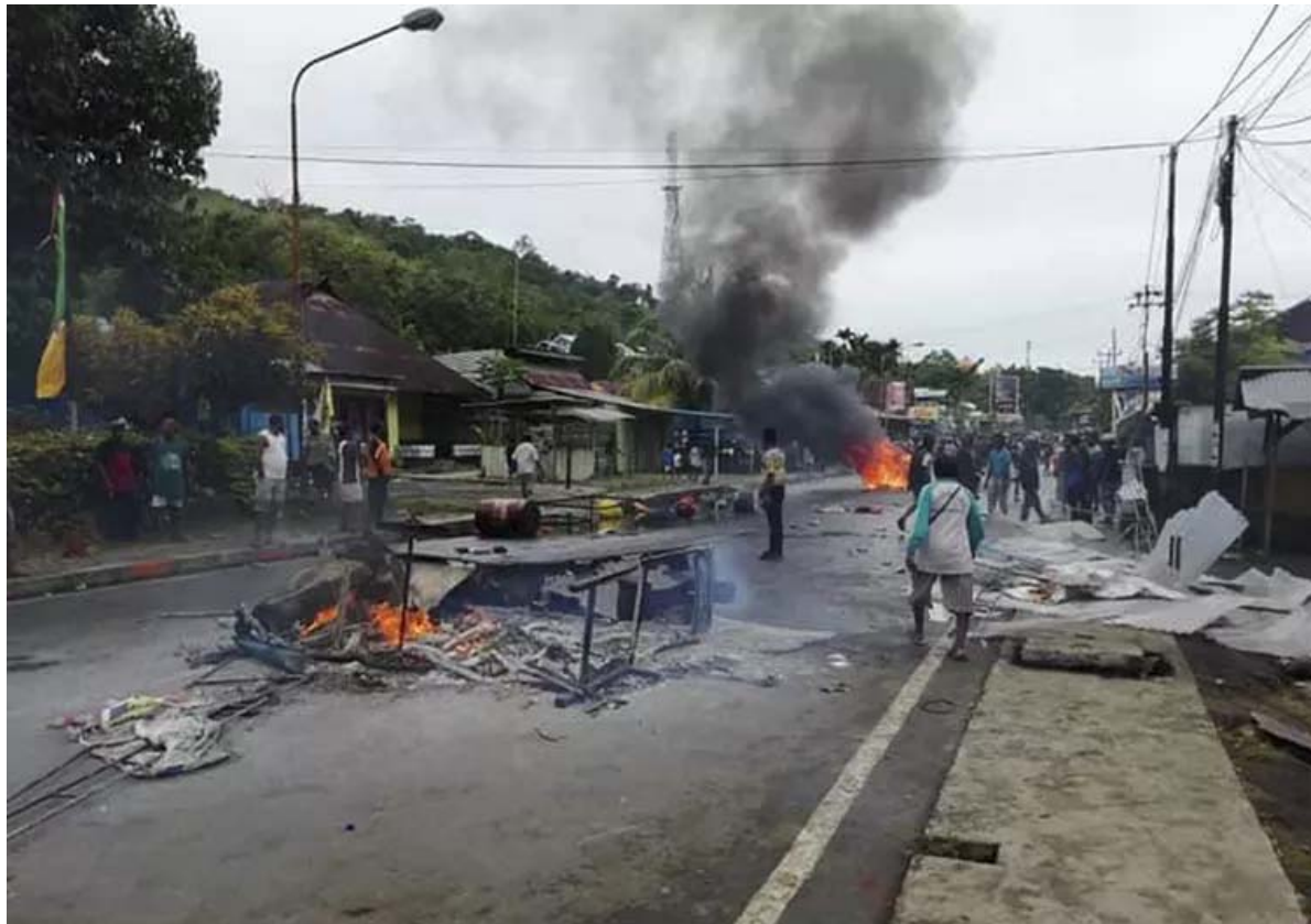
Protesters set fire to the local parliament building and cars in West Papua earlier this week.

In response to the deteriorating security situation, Indonesia has deployed more troops to the region.