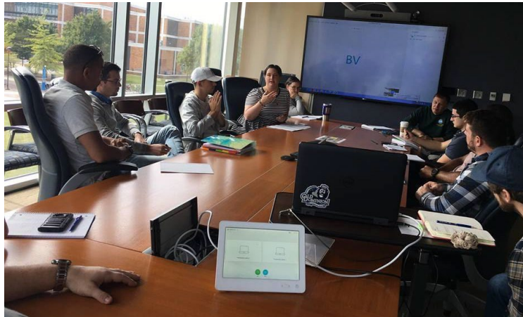
Figure 2: Seminar about transitioning from the military to a work environment by a fellow veteran staff employee

requested by the veteran student learning community. The first group of scholars attended a seminar course Veterans in Engineering and Engineering Technology that was offered in the Fall 2018 semester. Initial meetings collected data from veterans in open-ended focus groups. Students were asked what kind of support they need to be more successful. The students mapped course topics that would become part of their syllabus. Throughout the course, various lectures followed with visiting speakers from university career services, veterans who have a proven record of success in the different engineering jobs in government, industry, and academia. This project will last five years. Figure 2 shows one of the sessions from the seminar offered to the first cohort of S-STEM veteran scholars.