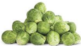
Brussels Sprouts $2.49