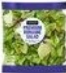
Marketside Premium Romaine Salad, 9 oz $2.38 each