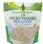
Green Giant Riced Veggies Cauliflower, 12.0 OZ $2.48 each