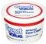
Great Value All Natural Grade A Sour Cream, 16 Oz $1.00 each