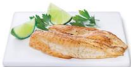
Fresh Tilapia Fillets $5.79/lb