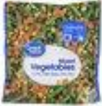
Great Value Steamable Mixed Vegetables, 12 oz $0.80 each