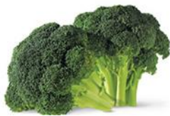
Broccoli $1.29 a crown