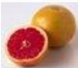
Red Grapefruit $1.18 each