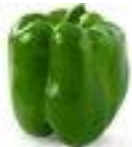
Green Bell Pepper $0.88 each