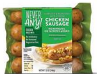
Never Any! Chipotle Chicken Sausage $2.99