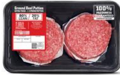
80% Lean Ground Beef Patties $3.69