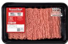
80% Lean Ground Beef $2.99