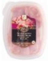
Private Selection™ Wildflower Honey Ham 8 oz $5.89