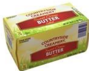
Countryside Creamery Butter $2.99/ 4 sticks