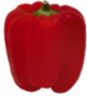
Red Bell Pepper