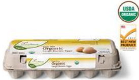
Simply Nature Organic Cage Free Brown Eggs $1.99