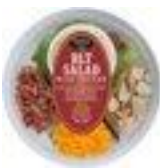
Taylor Farms BLT Salad w/ Chicken, 6.5 oz. $2.98 each