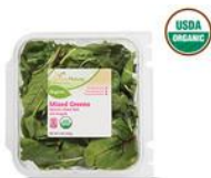
Simply Nature Organic Mixed Greens $2.49