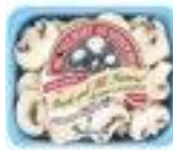
Sliced Mushrooms, 8 oz $1.98 each