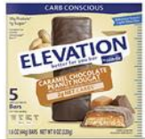
Elevation by Millville Caramel Chocolate Peanut Nougat Advance Bars $4.99 a box