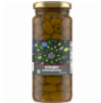
Kroger® Jumbo Pitted Ripe Olives 5.75 oz $1.29