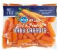
Kroger Cut & Peeled Baby Carrots