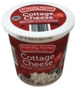
Friendly Farms Cottage Cheese Small Curd 4% Milk Fat $2.29/24oz