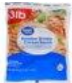
Great Value All Natural Boneless Skinless Chicken Breasts, 3 lbs. $6.14 each