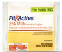
Fit & Active® 2% Milk American Singles $1.99