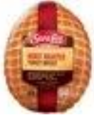
Sara Lee Honey Roasted Whole Turkey Breast, Deli Sliced $6.98 / lb