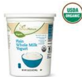
Simply Nature Organic Whole Milk Plain Yogurt $3.69/32oz