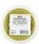
Freshness Guaranteed Guacamole, Mild, 8 oz $2.88 each