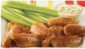
Kirkwood Fresh Chicken Wings $8.99 a bag