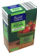
Sweet Additions Stevia Sweetener $3.29 a box