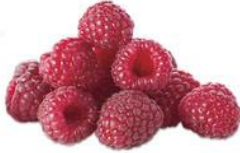
Raspberries $2.49 pt.