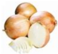
Onion - Sweet - Yellow