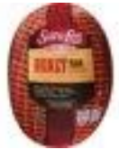
Sara Lee® Premium Meats Honey Ham $5.98 / lb