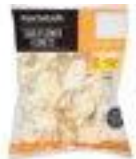
Marketside Cauliflower Florets, 16 oz $2.48 each