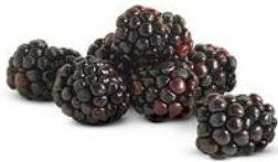
Blackberries $2.49 pt.