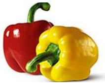
Bell Peppers $1.49 for 3 pack