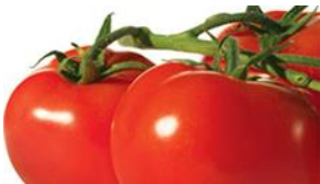
Tomatoes $1.49 for 4