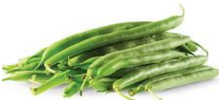
Green Beans $1.49