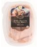
Private Selection™ Oven Roasted Turkey Breast 8 oz $5.89