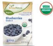
Simply Nature Frozen Organic Blueberries $2.29