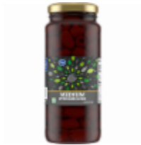
Kroger® Medium Pitted Ripe Olives 6 oz $1.29