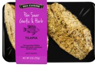
Sea Cuisine Smart Flavor Pan Sear Garlic & Herb Tilapia 9oz $8.99