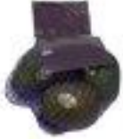
Organic Hass Avocados, 3-5 Count Bag $4.96 each