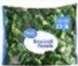
Great Value Broccoli Florets, 12 oz $1.00 each