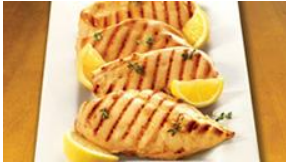
Kirkwood Fresh Boneless Skinless Chicken Breasts $5.99 per pack