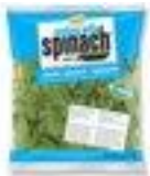
Spinach, 16 oz $2.98 each