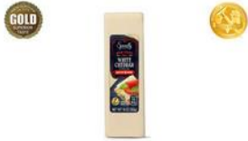
Specially Selected Aged Reserved White Cheddar $2.49