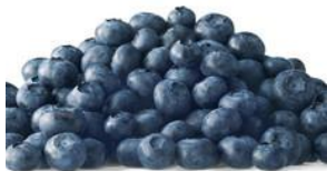
Blueberries $1.69 pt.