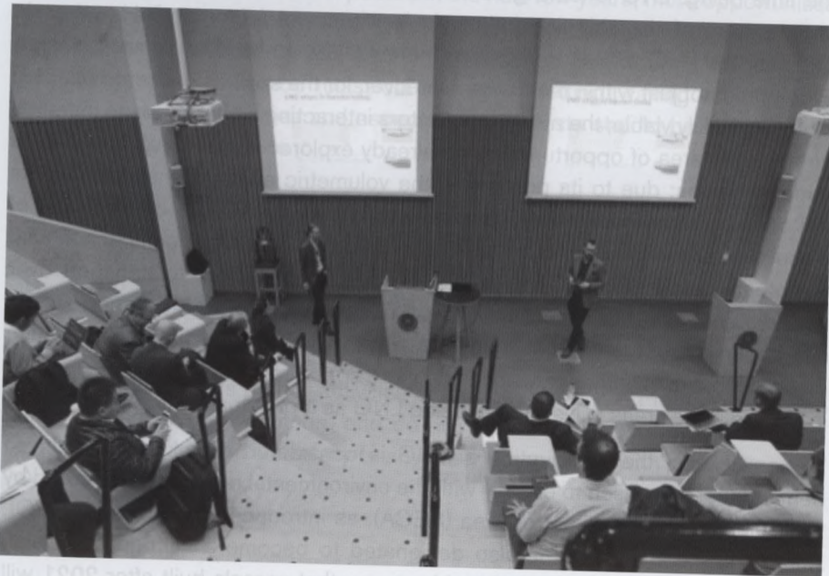
Figure 2. Delivery of the course under the “Go LNG” project

measures and procedures to be taken in the event of leakage, spillage, venting of the fuels.