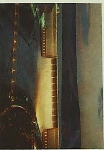
See mighty Grand Coulee Dam in Eastern Washington.