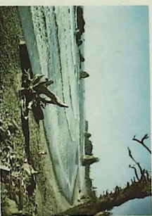
Play, fish and camp on ocean beaches in the Evergreen Playground.