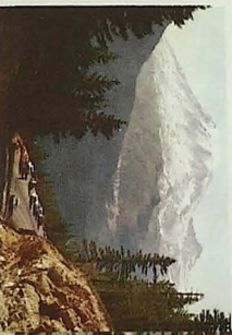
Visit magnificent Mount Rainier, only a short drive from Seattle and Tacoma.