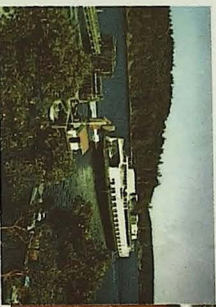
Ride a Ferry to Fairyland on beautiful Puget Sound.