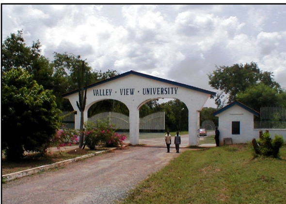
Left: Entrance to Valley View University.

We awake at six to bright daylight and bird song. Our room is one of forty that surround a grassed courtyard on all four sides. Once up and dressed, we meet Isaac, the Women's Centre caretaker, a short pleasant man