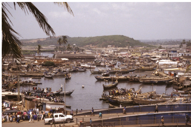
Above left: Elmina Castle; Above right: Harbor and Fish Market.