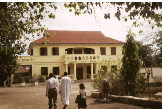
From Left: Royal Palace, Kumasi; Ashanti Priest receiving the Golden Stool; Original headquarters of the SDA Church in West Africa.