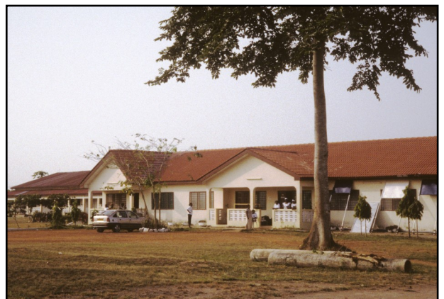
Right: Women's Center, our home for 3 weeks in Ghana.