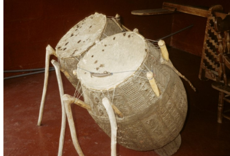
Far Left: Kumasi Markets; Left: Talking Drums at Ashanti Royal Palace, Ku- masi.

Ghana has some interesting practices in regard to funerals. When a person dies, the burial usually takes place within a few days as a family event and is followed by several weeks of mourning. But the funeral can occur anywhere from two months to two years after the death, and is really a time of celebration, often lasting for an entire day and often associated with partying and drinking. Traditionally, funerals were held on a Monday or a Thursday, but to lessen disruption to the business week, they are now usually held on a Saturday or a Sunday. Some communities designate a particular day in the month when all funerals will occur. This is particularly convenient for anyone who wants to do the rounds of all the funeral celebrations going on in the village. As we travel home this afternoon we pass through several villages and towns where people are garbed in black, indicating that funerals are taking place there.