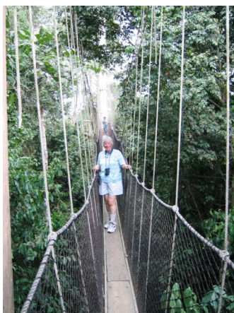
Canopy walk at Kakum National Park; Weaver Bird Nests.

Back at the Botel, we cleanup for our dinner at the restaurant, choosing a table over the water where we can spot crocodiles, observe kingfishers diving for supper, and watch hundreds of colorful weaver birds at their noisy colony on two nearby trees. By the time we finish eating it is getting dark and great flocks of white egrets settle in the trees, occupying whatever space is not already taken by the weavers. Finally the bird chorus dies away, and we make our way back to our room, cold showers, and bed.