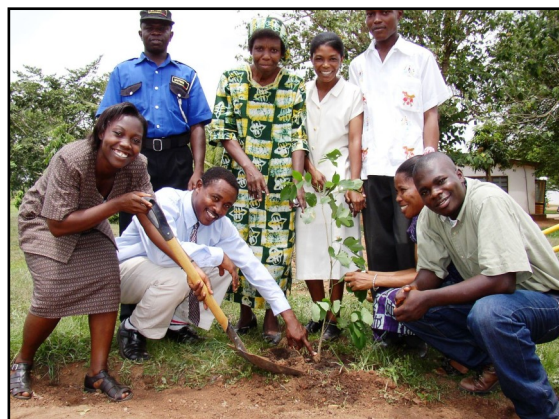
Right: A tree is planted by the library staff in my honor.