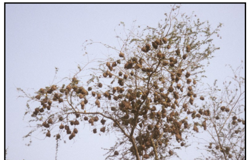
Right: Weaver Bird Nests.