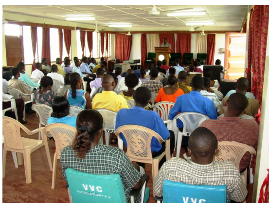
Left: Church service in the Chapel.

By 7.00 this evening we have made good progress with the library rearrangement, and all agree to meet again at 8.00 tomorrow morning to complete the job. We've moved the large and heavy circulation desk to a new location and are re-using the space for newspaper reading. It has been hot and dusty work, but there have been plenty of helpers – more than we needed, really – to move books, shelving, tables and chairs. Everyone seems excited about what is happening here.