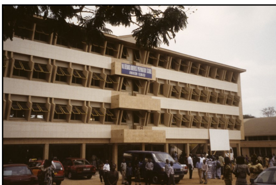
Far Left: Amakom SDA Church, Kumasi. Left: Amakom SDA School.