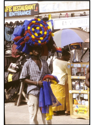
From Left: Cape Coast Castle; Fishermen pulling nets; This guy sells rolls of cloth.

Elmina is a fascinating place, the site of the first European structure in sub-Saharan Africa. Here the Portuguese landed in 1482 to trade guns, metal goods and alcohol for gold and ivory which the natives brought from the interior. The Portuguese built a fortress on a rocky headland to establish and defend their post. About 150 years later, the Dutch snatched the castle from the Portuguese and enlarged it to what it is today. By that time slaves were worth more than gold, so the newcomers turned the dark basement storage rooms into dungeons where at least 150 Africans at a time were held pending shipment to the Dutch colonies in the Caribbean.