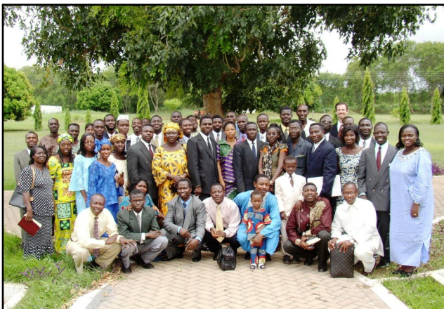
Below: Faculty and Staff of VVU; Right: Campus Master Plan in 2004