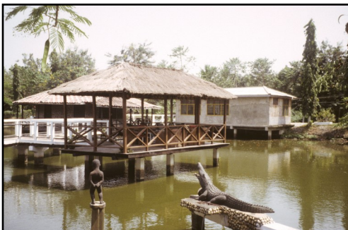
Left: Hans Cottage Botel near Cape Coast.

Our abode for the next two nights is a rather picturesque forest resort known as Hans Cottage Botel. An enterprising Dutchman has built a wood-and-thatch restaurant on a stilted platform over a small lake stocked with fish and crocodiles, and connected it to shore via wooden walkways. In the lodge behind the lake we may choose a room with fan or one with an air-conditioner. We choose the latter.