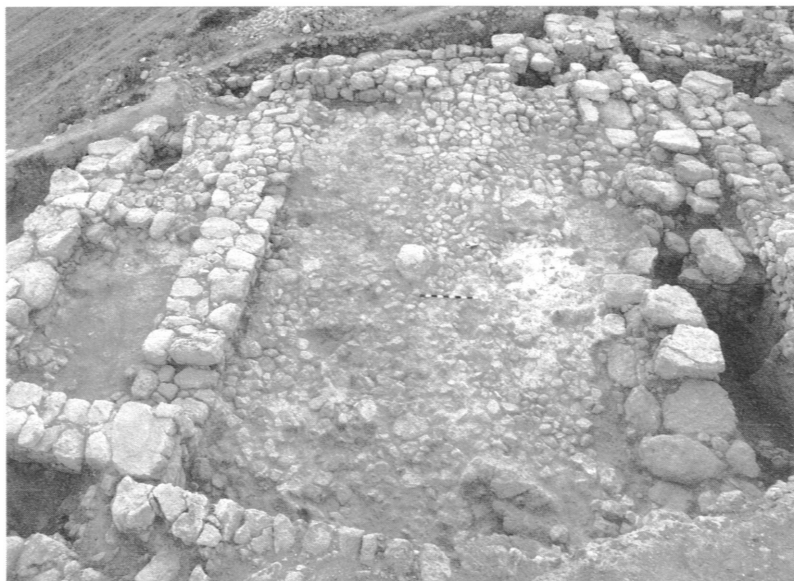
Figure 7. The cobbled courtyard sanctuary from the east with the earliest pavement thus far discovered.