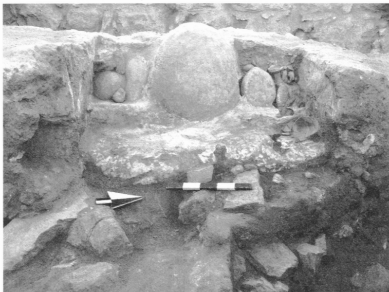
Figure 6. Field B: The cultic niche with pottery vessels in situ .