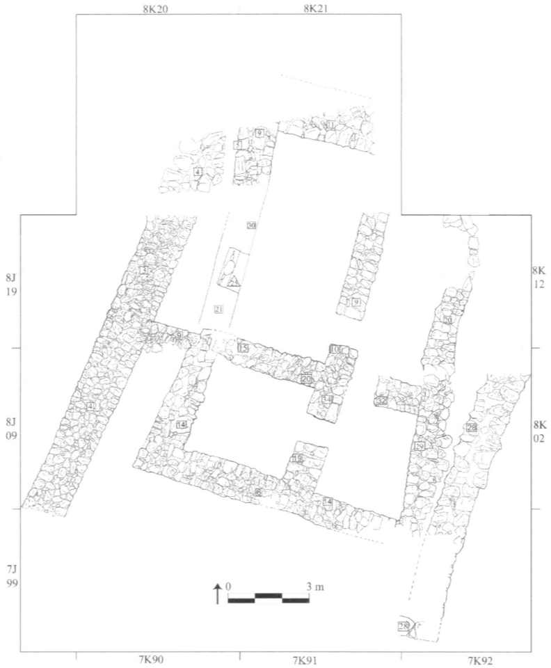
Map 4. Field B: Plan of the Late Bronze Age palace.