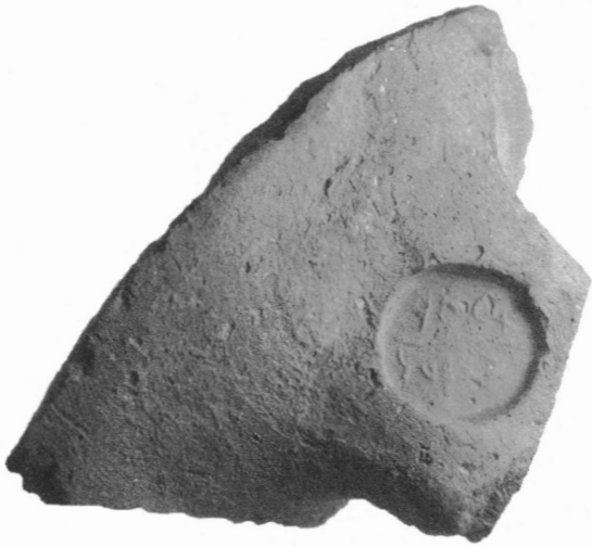
Figure 11. Field B: Person-period seal of the Province of Ammon with a personal name.