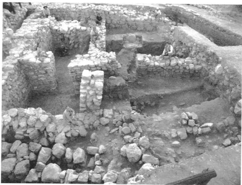
Figure 2. Field B: View of the Late Bronze Age palace from the east.