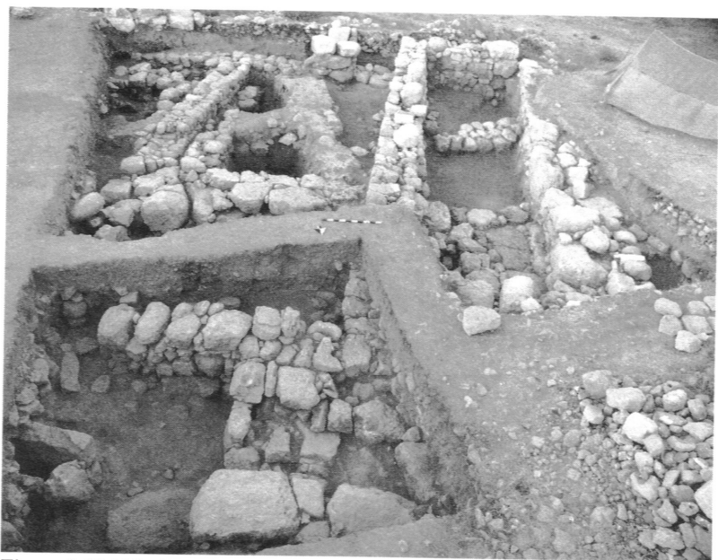
Figure 9. Field L: Overview of Field L at the end of the season.