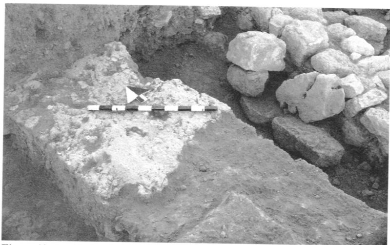
Figure 10. Field L: Fragment of a fine plaster surface from the Hellenistic period.