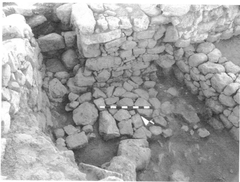
Figure 1. Field A: Iron 1 flagstone floor with a pillar base near a doorway.