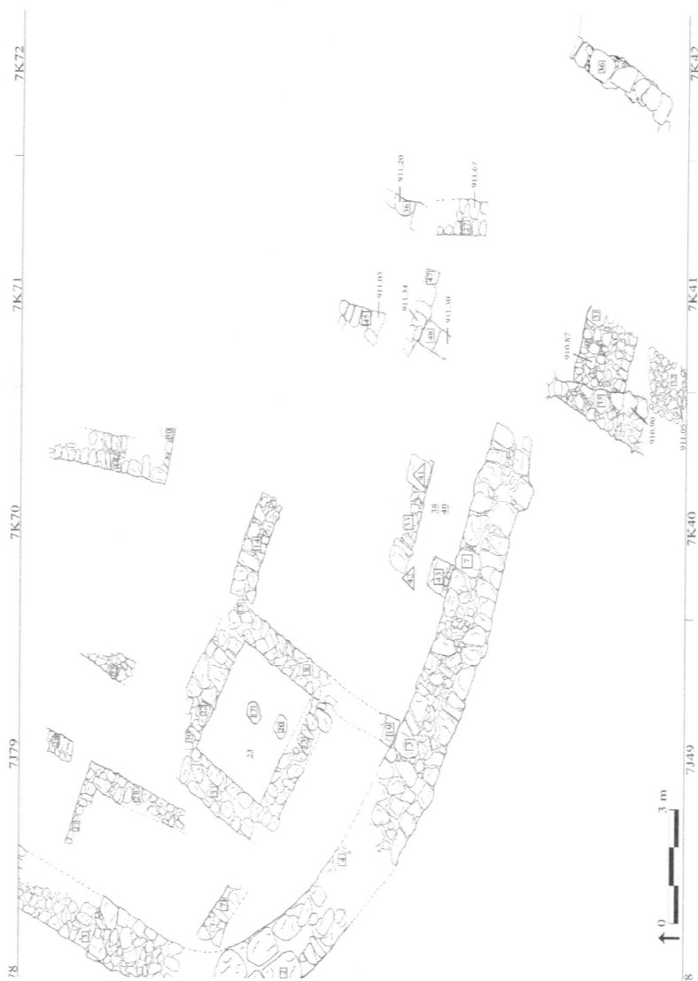
Map 3. Field A: Plan of the Iron 1 perimeter wall and associated houses of early Iron 1 in Phase 11.