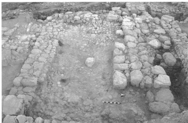
Figure 8. Field H: The cobbled courtyard sanctuary in its second phase.