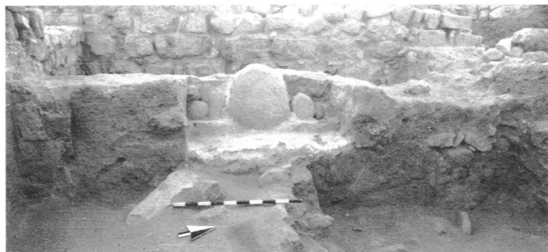
Figure 4. Field B: The cultic niche in Room 3 of the Late Bronze Age palace.