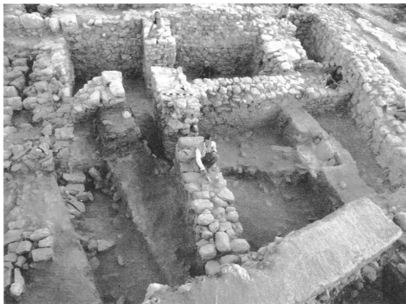
Figure 3. Field B: View of the Late Bronze Age palace from the north.