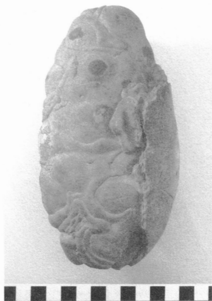
Figure 5. Field B: Closeup of the chert nodule with natural solution deposits.