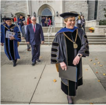
FOCUS | Fall 2016