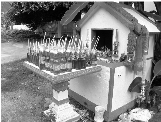
Figure 2. Spirit house in Thailand

Let us consider a real-life example. There is a spirit house located at a three-way intersection a couple of blocks away from the Thailand Mission office in Bangkok. The corner is dangerous because the perpendicular road emerges between two high walls making it very difficult to see oncoming traffic. This particular spirit house is really quite attractive and well taken care of. It has a clean white paint job with bright orange trim work. The dozens of bottles of red Fanta soda set on the table in front of the spirit house are regularly replaced which indicates the degree of devotion its owner has. If you were to come at the right time, you would also notice that there are regular visits by the owner to offer his or her prayers and offerings. Some passersby honk their horn or wai (bow) to the spirit house.