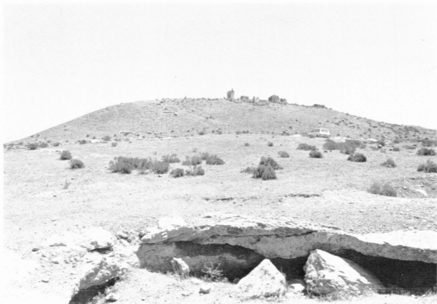
A. Tell Jalul. View to east.