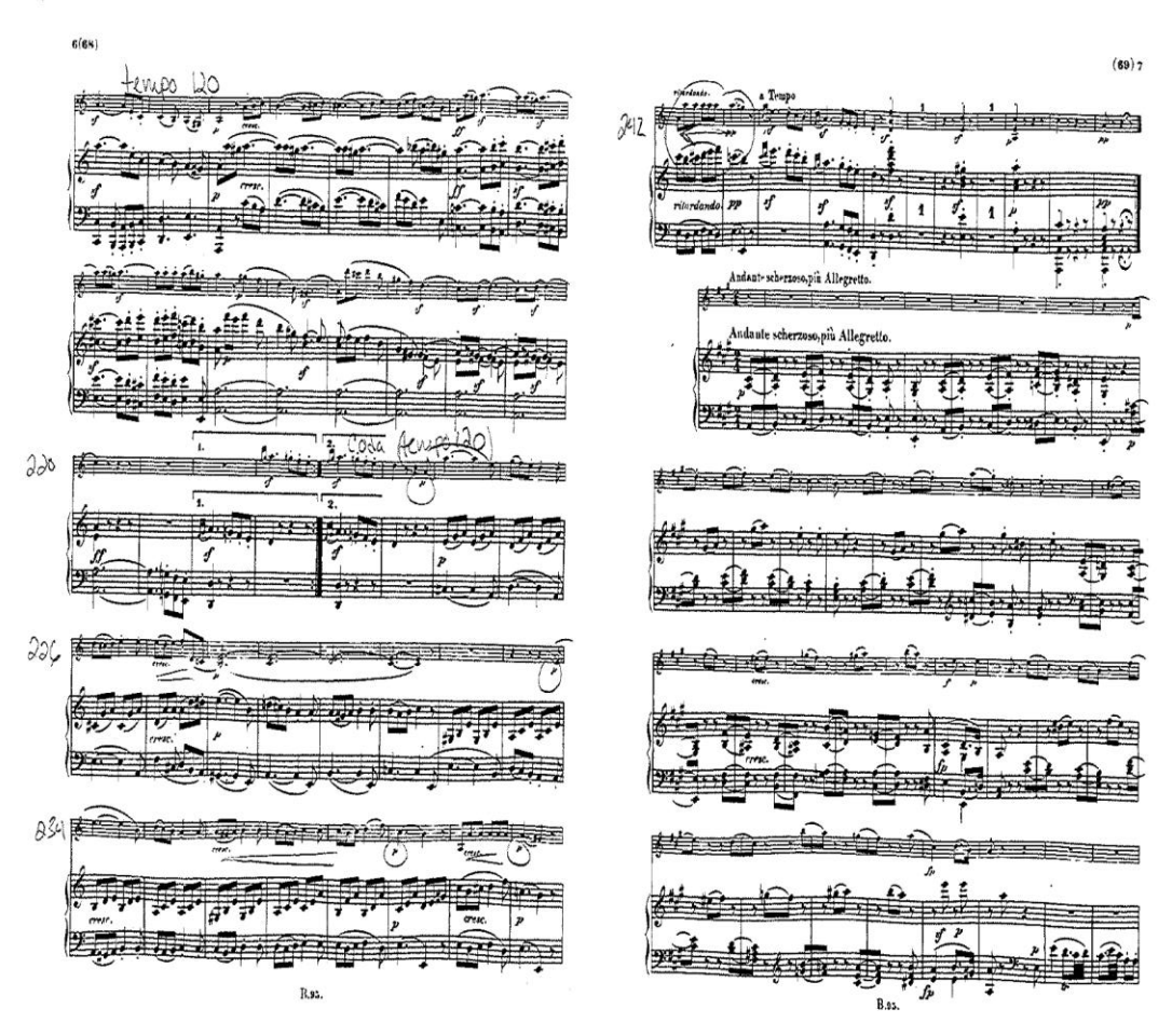
Test Area 2: Score Analysis of Rubada auto Dynamics