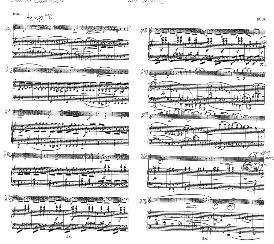
Test Area 3: Score trabasis of Rubaso and Dynamics