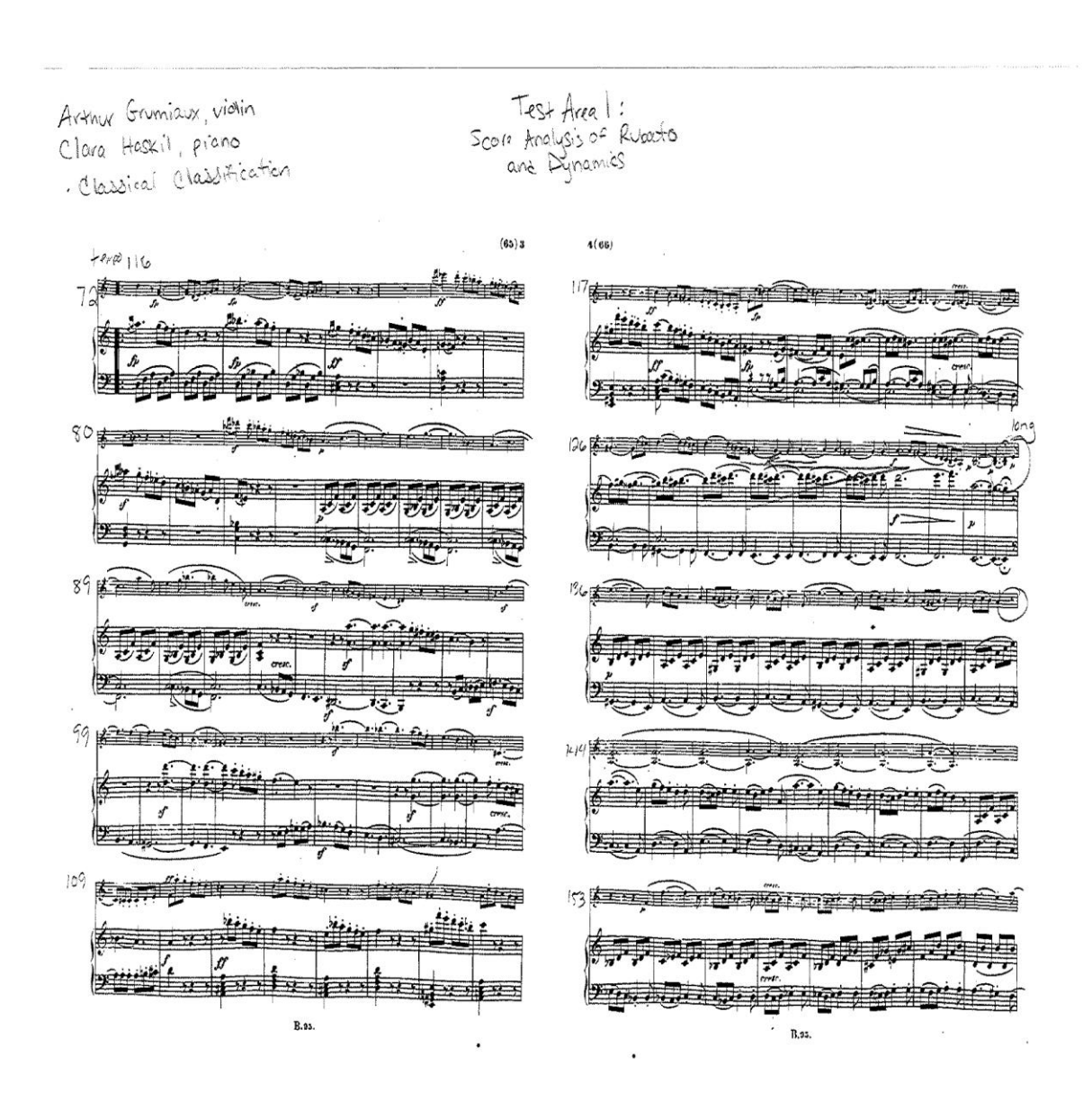
Appendix 2. In-score markups