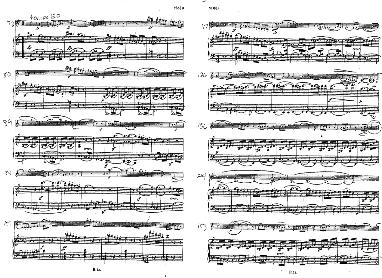
Test Area 1: Score Arralysis of Rubato and Dynamics