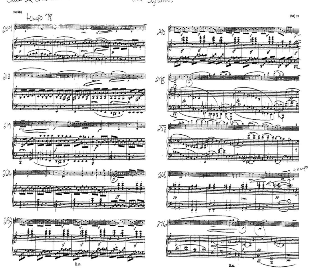
Test Avea 3: Score Analysis of Rubato and Synamics