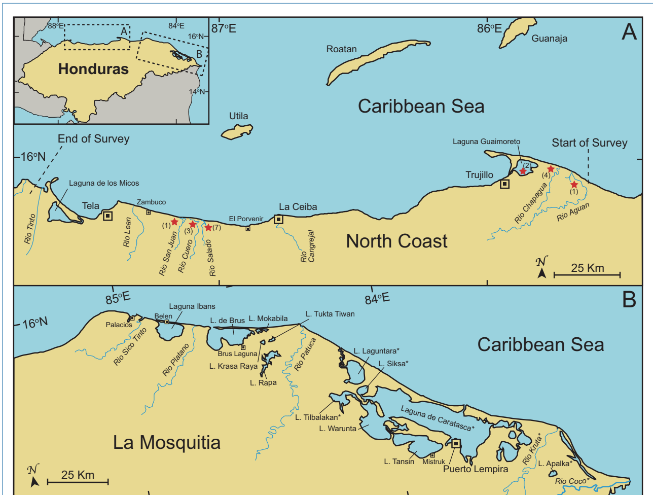
Figure 2. Distribution of manatee sightings from aerial surveys of the Caribbean coast of Honduras in 2006-07. A) Enlarged survey area of the North Coast of Honduras. Locations of manatee sightings (solid stars) along with the total count (parenthesis) for the six surveys in 2006. The area between the towns of El Porvenir

and Zambuco (small squares) was used from direct comparison of sightings with the 1979-80 surveys. B) Enlarged survey area of La Mosquitia highlighting major rivers and lakes. Rivers and lakes not included in the 2007 surveys are designated by an asterisk (*).