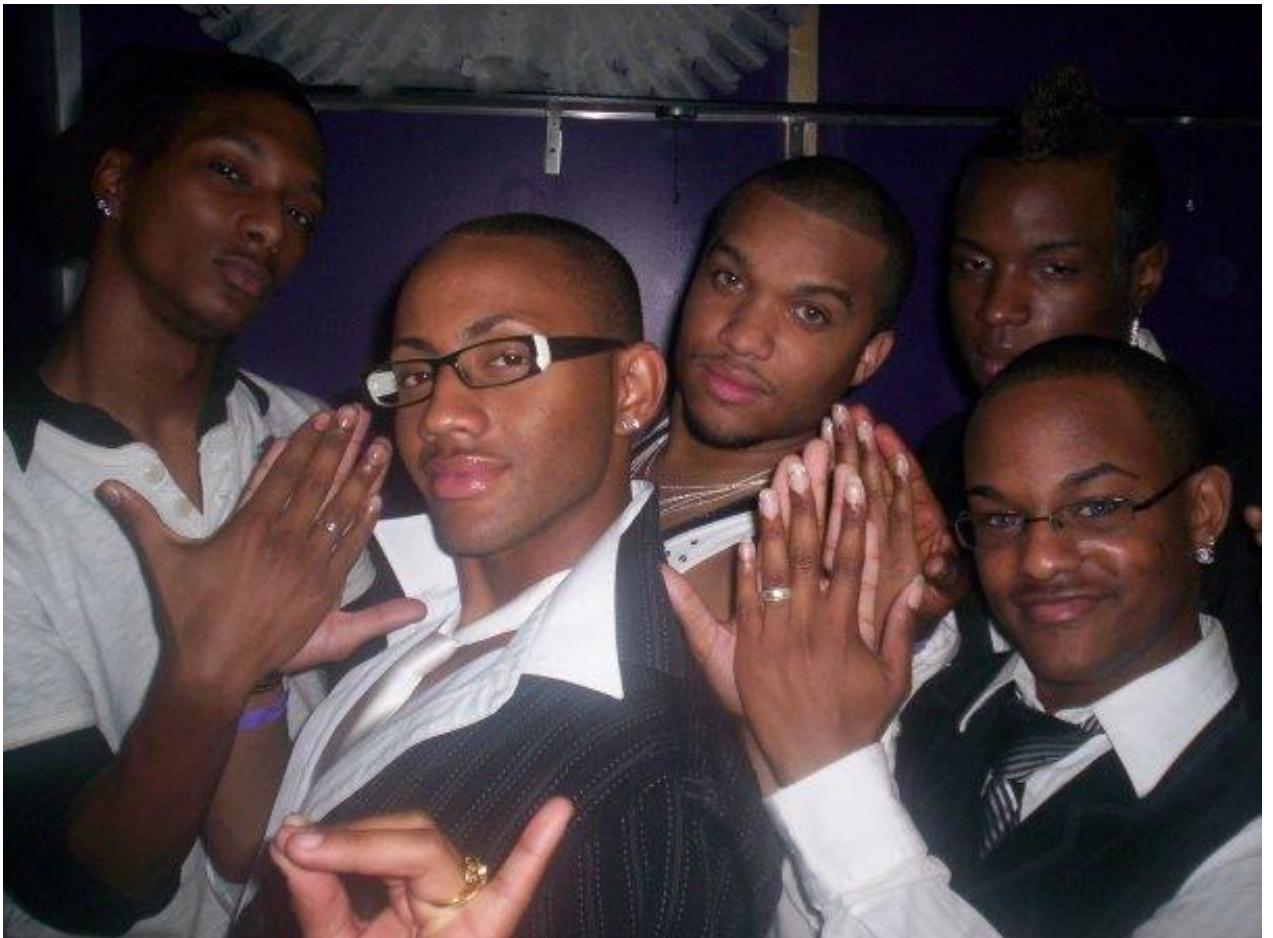
Figure 4. One of the MIAKA pictures that surfaced in 2007 and resurfaced in 2012 on the KollegeKidd website. This picture circulated widely in the press and social media. Retrieved from http://kollegekidd.com/news/miaka-to-file-lawsuit-against-alpha-kappa-alpha-sorority-inc-for-discrimination/ .