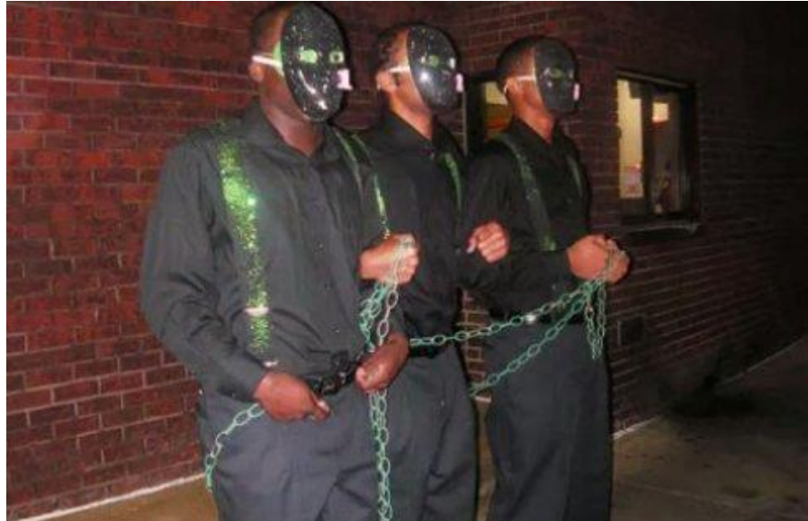
Figure 3. Photo from a video of MIAKAs that surfaced in 2012 (Kohli, 2012).

Let's consider the MIAKA melodrama resurgence in June of 2012. The catalyst of this reemergence was a video of alleged MIAKAs during a probate or new member show that circulated online. Journalist Kirsten West-Savali (2012) writes, "This video, showing 'MiAKA men' imitating the calls, signs, attire and external mannerisms of the ladies of AKA, was accompanied by persistent rumors that MiAKA was threatening to sue Alpha Kappa Alpha Sorority for inclusion based on the grounds of gender discrimination." This time, the video and rumor of a potential lawsuit by MIAKAs against AKA seem to have originated from the blog/forum website KollegeKidd.com . Though there has never been any evidence of a lawsuit by MIAKA against AKA for discrimination, this did not stop several prominent media outlets and personalities from running the story, including, but not limited to, The GRIO , The Huffington Post , Ebony , Madamemoire , Atlanta Black Star , Philadelphia Inquirer , and several black radio stations. Erin Ryan (2012) reporting for Jezebel writes, "In none of the reports did any news outlet quote a source or attorney from MiAKA." In fact, most of the reported