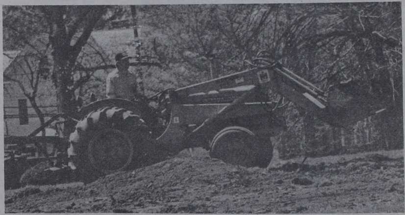
What appears to be a common bulldozer has turned out to be a key in the school's ground forces.

Minutes of early committee meetings indicate that the aggressive action to the north is a result of stiff resistance from the Collegeville government on the southern front.