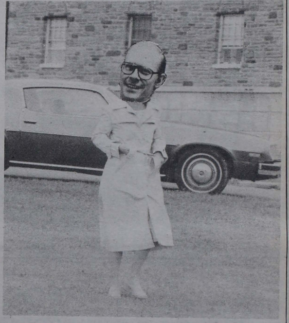
Reagan picks silo site