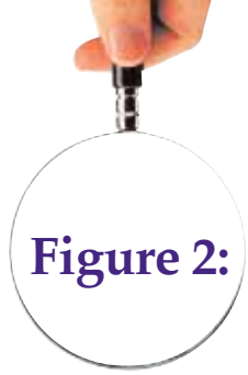
Figure 2: Decision Errors and Associated Costs