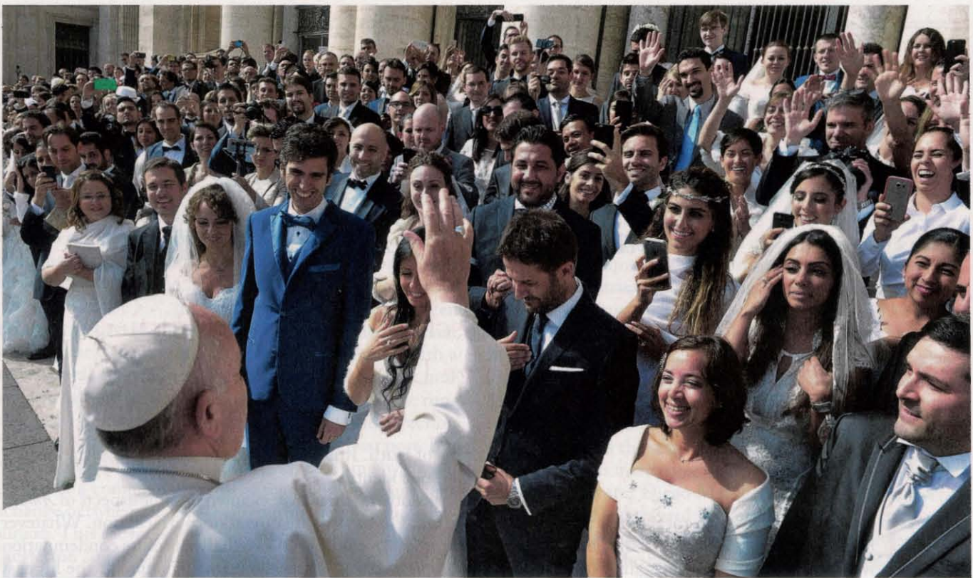
Pope Francis greets newly married couples in St. Peter's Square, September 30, 2015.