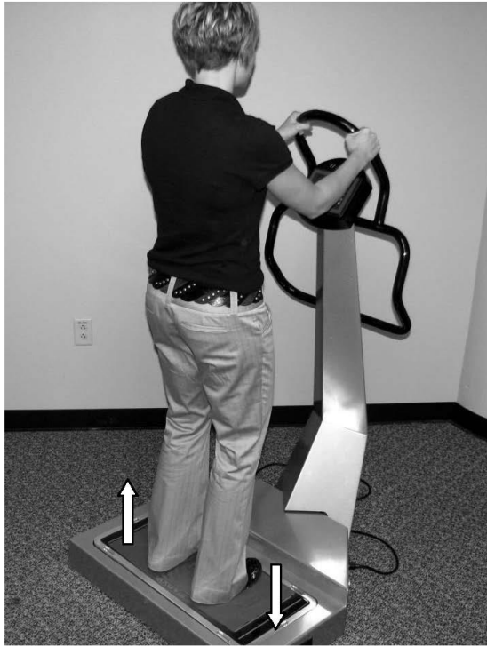
FIGURE 1. Maxuvibe ® vibration platform (Fitgroup BV, Hoogstrat, Holland)

extremities. 26 This type of vibration has also been shown to elicit a significantly great response of the knee extensors than vertical vibration. 10 Vibration frequencies of 2 and 26 Hz with a 6 mm peak to peak amplitude were used because these parameters are consistent with previous WBV research demonstrating increased muscle activity and muscle performance during and following WBV exposure. 10,23 Subjects were asked to wear thin-soled shoes and to use the same shoes on