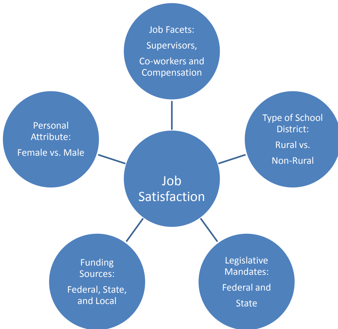
Figure 1. Potential predictors of job satisfaction for public school superintendents.