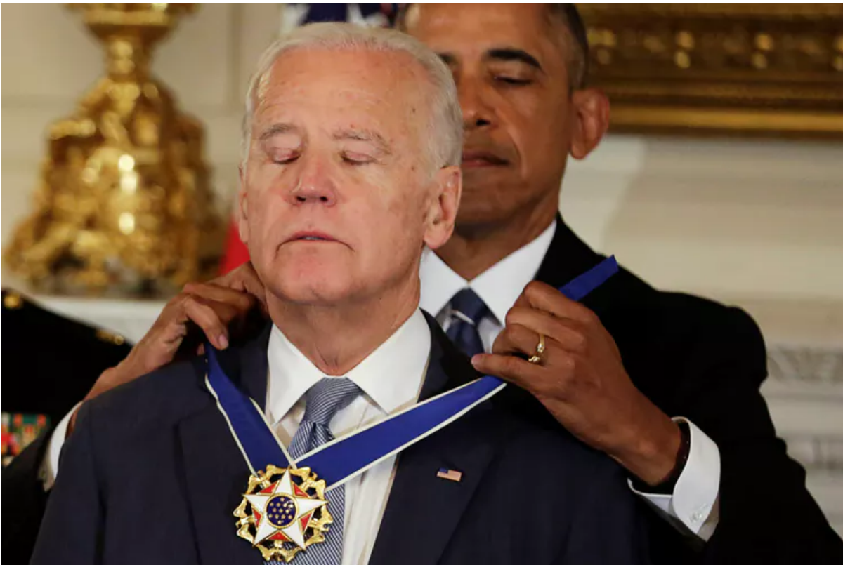
Obama honors his Vice President Joe Biden with the Presidential Medal of Freedom in 2017.

Obama awarded his last Presidential Medal of Freedom to his vice president Joe Biden.