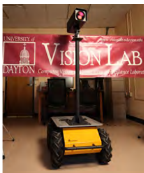
"The Vision Lab's Robust Artificial Intelligence-based Defense Electro-Robot (RAIDER) is leading the way with autonomous navigation and interior surveillance."

Taking surveillance research to the next level, the University of Dayton Vision Lab is making automatic security robots. The new Vision Lab robot, named the Robust Artificial Intelligence-based Defense Electro-Robot (RAIDER), combines many of the Vision Lab's biometric algorithmic to create a machine that "remembers". Using the face recognition technology, the RAIDER will be able to roam the Kettering Labs hallways recognizing people it has previously seen and becoming familiar with faces of new students. In addition to