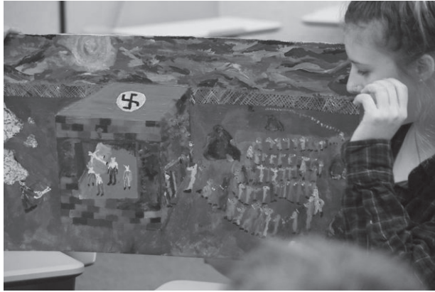
FIGURE 23.2. Anne's painting.

I think that in a moment, at home the night before we talked, the safety of time and distance collapsed.”