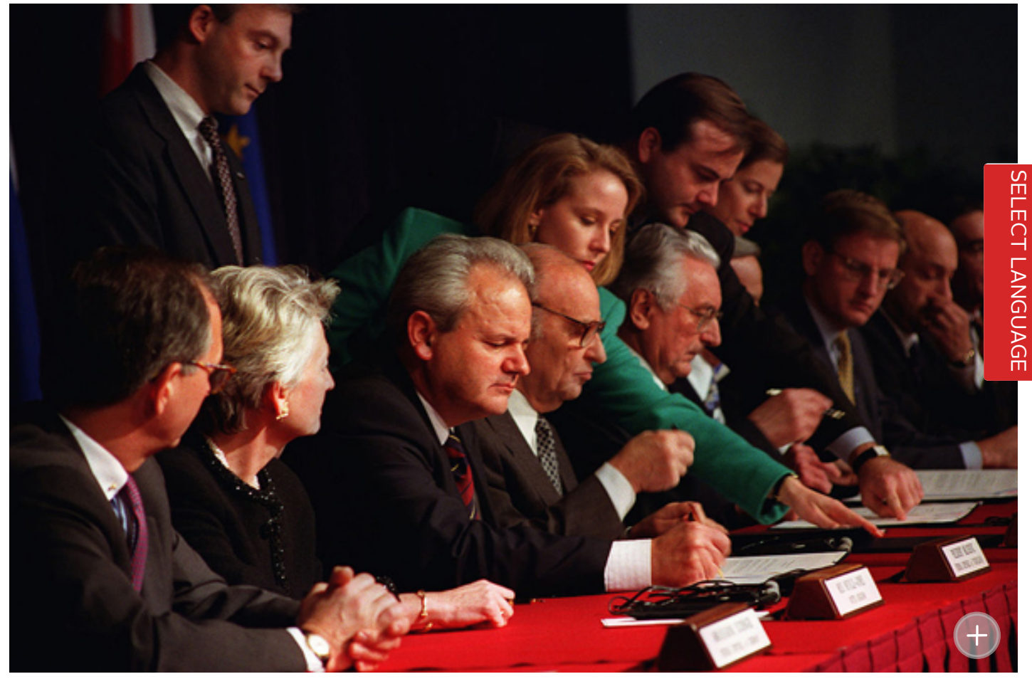
Tuesday November 10, 2015