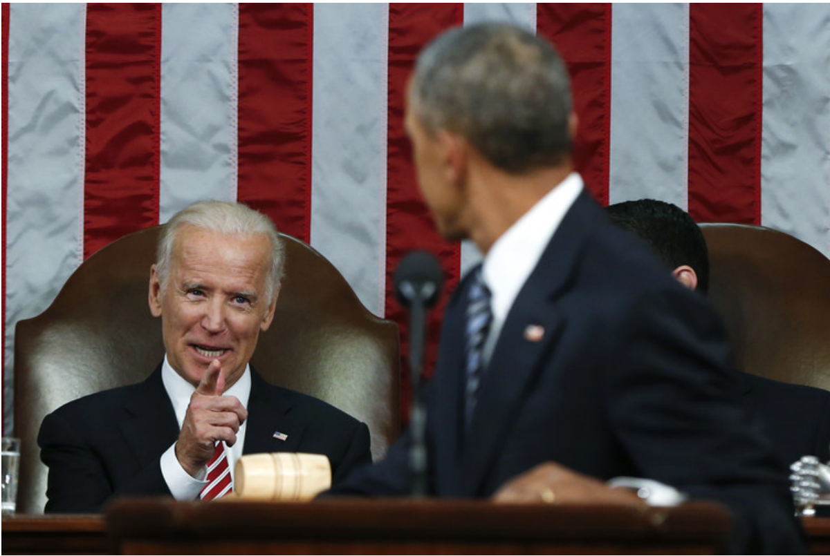
Vice President Joe Biden during Obama's final State of the Union address.

Cheney played a key role in shaping Bush administration policy on matters ranging from energy to terrorism and the Iraq War. Biden was a key adviser on foreign policy matters including the war in Afghanistan and the Osama bin Laden raid. He served as the administration's liaison to Congress on domestic matters including health care, the "fiscal cliff" negotiations, gun control and the cancer cure "moonshot." It is very likely that Kaine or Pence will exercise similar influence as vice president.