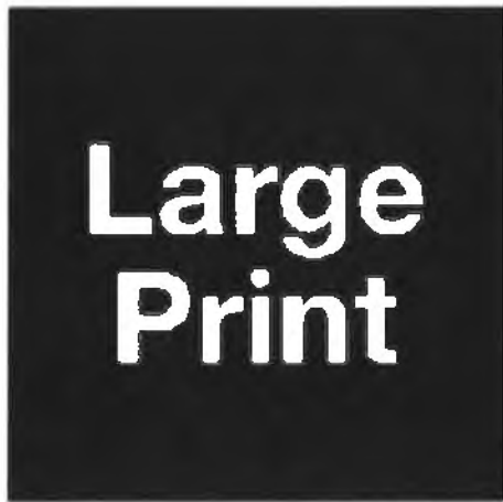
Large Print Documents