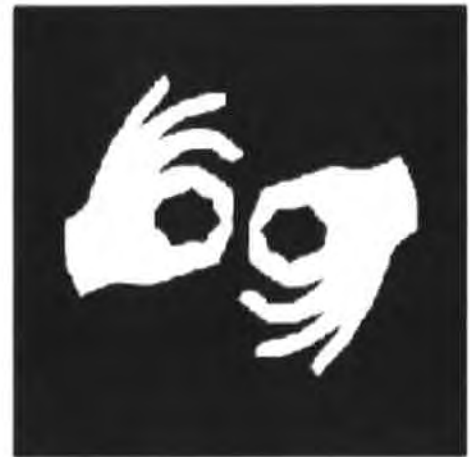
American Sign Language