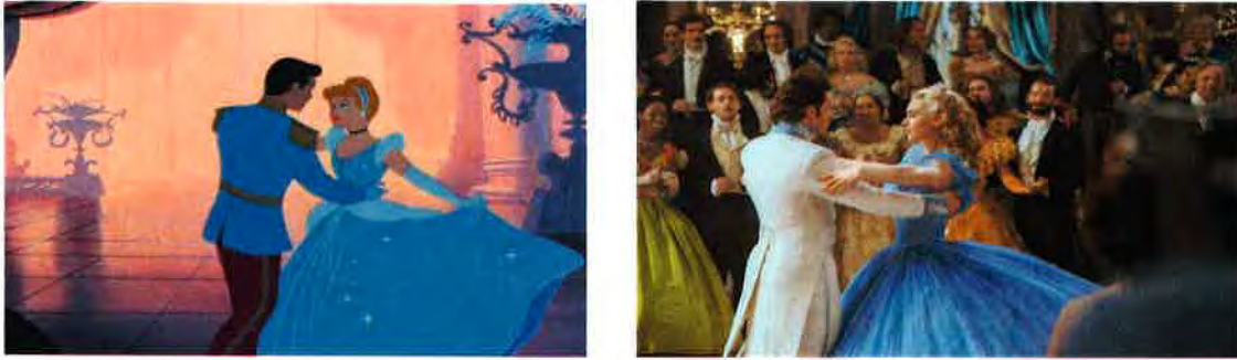
Ball scenes: 1950 (left) compared to 2015 (right)

It almost seems as though the filmmakers took the cartoon and just transferred it into live-action. However, this does not discredit it or make it any less valuable. Some aspects are more developed, like the relationship between the King and the Prince, and the stepmother's motives for her cruelty. The prince and king enjoy a deep friendship and respect. The stepmother feels overshadowed by her husband's first wife—he clearly loves Cinderella and her dead mother more than he loves his new wife and stepchildren. Branagh also gives more details into the lives of Cinderella's parents. Perhaps this reflects some of the ways society has changed since 1950. Modern viewers love a good backstory, a way to relate to and understand even the most negative of characters. Two-dimensional characters have become an anathema among recent generations. What is the point of this remake, then? Speaking for fellow millennials, I would say it shows our nostalgic longing for our own childhoods. We want to relive the wonder the Disney cartoon gave us in childhood. Branagh's film brings a beloved story to real life. This movie breathes fresh life into the 1950 version and in doing so, makes it more relatable to 21 st -century viewers.