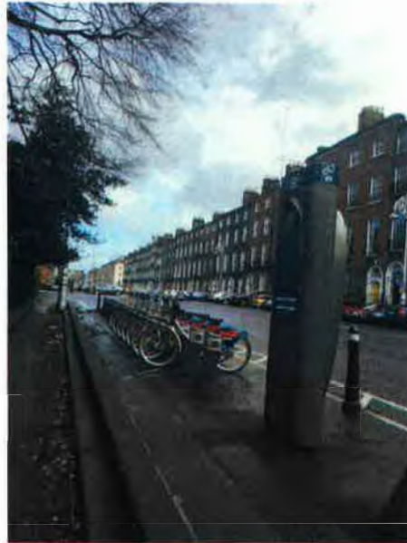
A modern view of the Dublin street on which Wilde lived as a child.

The unnamed city in The Happy Prince could easily be London. The majority of characters that make an appearance sound like impoverished Londoners: a seamstress with an ill little boy, a cold and hungry aspiring playwright, a match-girl with no clothing and an abusive father. When the swallow flies over the city to report to the Prince what he sees, he describes “the white faces of starving children” and “two little boys [that are] lying in one another’s arms to try and keep themselves warm” (302). The Prince and the swallow see nothing but misery, which Wilde describes all too realistically.