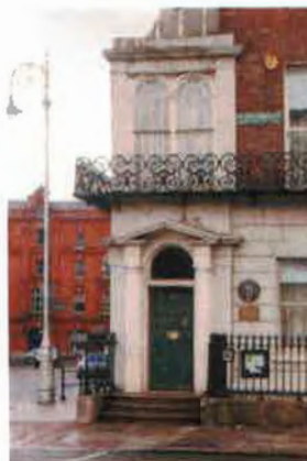
A modern view of Wilde's childhood home.