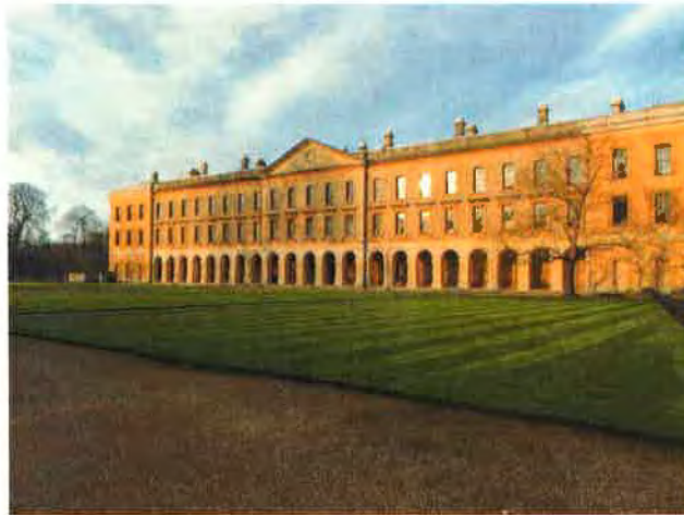
Magdalen, Wilde’s college at Oxford.