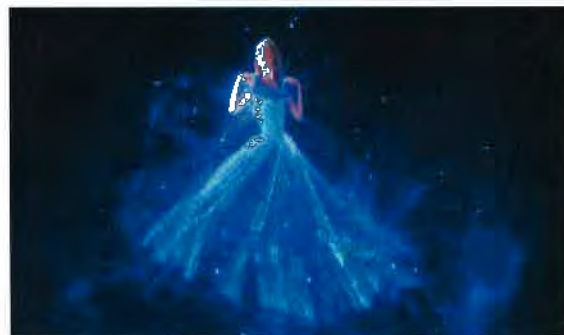
Transformation scenes: 1950 (left) compared to 2015 (right)