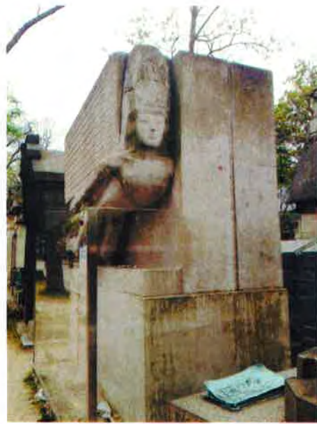
Oscar Wilde's grave in Paris.

remaining three years (“Oscar Wilde”). He no longer shone as brightly, nor produced works that left England in a daze, nor interacted with his own countrymen. He died in Paris in 1900. Despite the tragic turn that his life took, however, he still remains one of the greatest and wittiest British writers, who could dish out both scathing satires and insightful fairy tales.