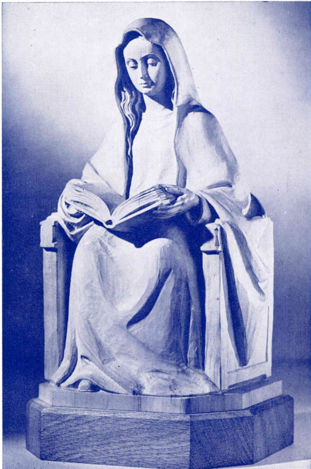
OUR LADY OF THE MARIAN LIBRARY