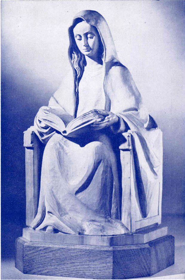
OUR LADY OF THE MARIAN LIBRARY