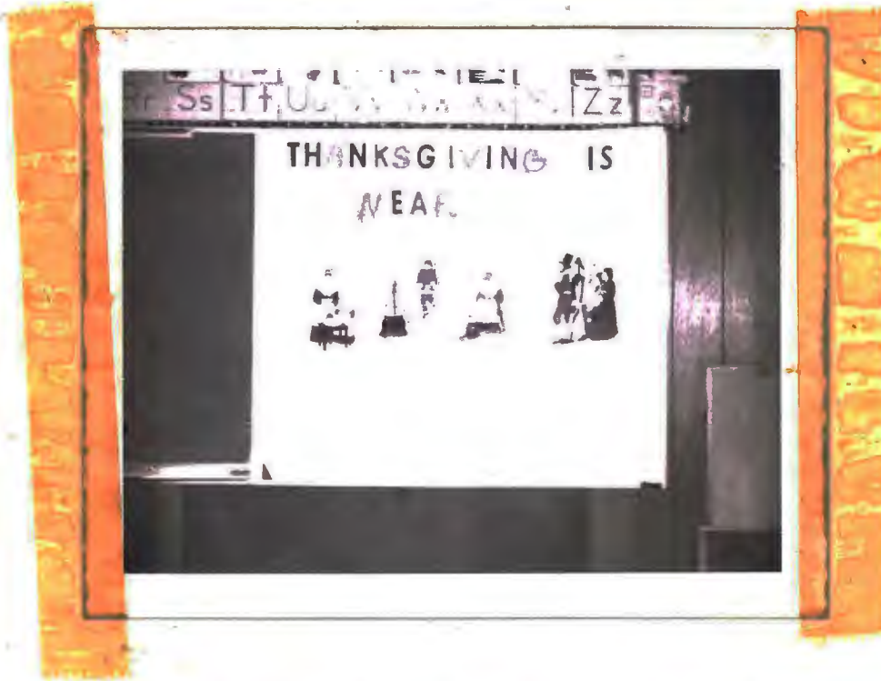
"Thanksgiving" - Bulletin Board