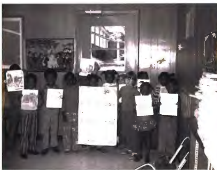
Pupils holding examples of their art work.