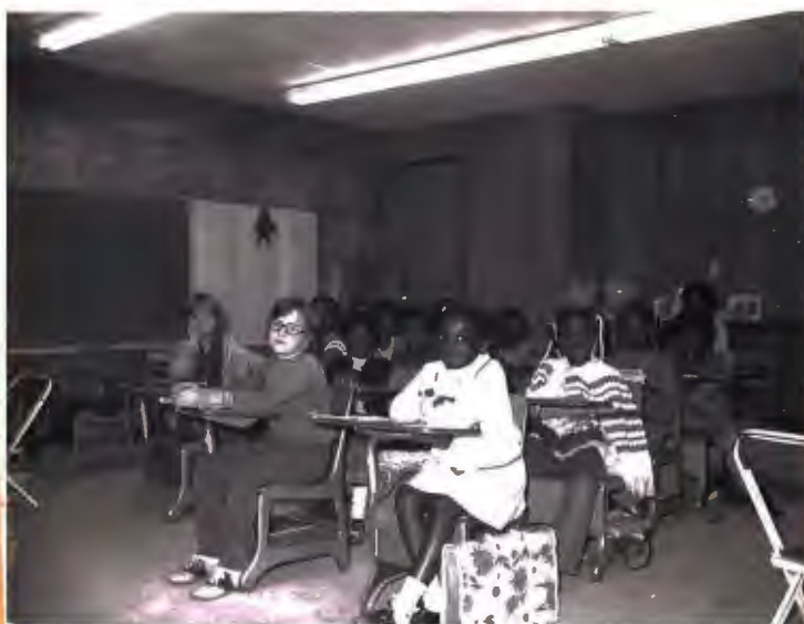
First Grade Class