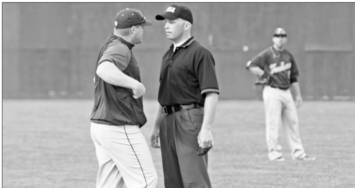
A Fordham University baseball coach argues with an umpire, Friday, April 13 at Woerner Field.

Think you've got an eye for photography? Here's your chance to get it published. Just send your 'CLICK' picture to editor@flyernews.com along with your first and last name and a brief description. Click away!