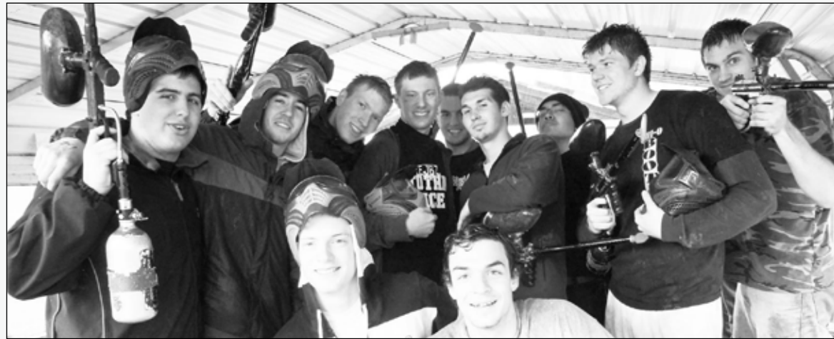
Students pose during a Campus Activities Board event, Saturday, April 14, at RUSH Paintball in Miamisburg, Ohio.