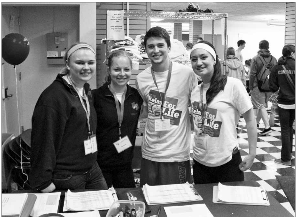
Relay for Life organizers pose during this year's event, Saturday April 14, in the Chaminade Hall basement. The event was moved indoors from the Central Mall due to rain.