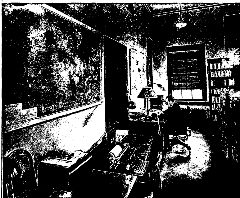
Headquarters of the Marian Library—Showing Map Designating World Contacts