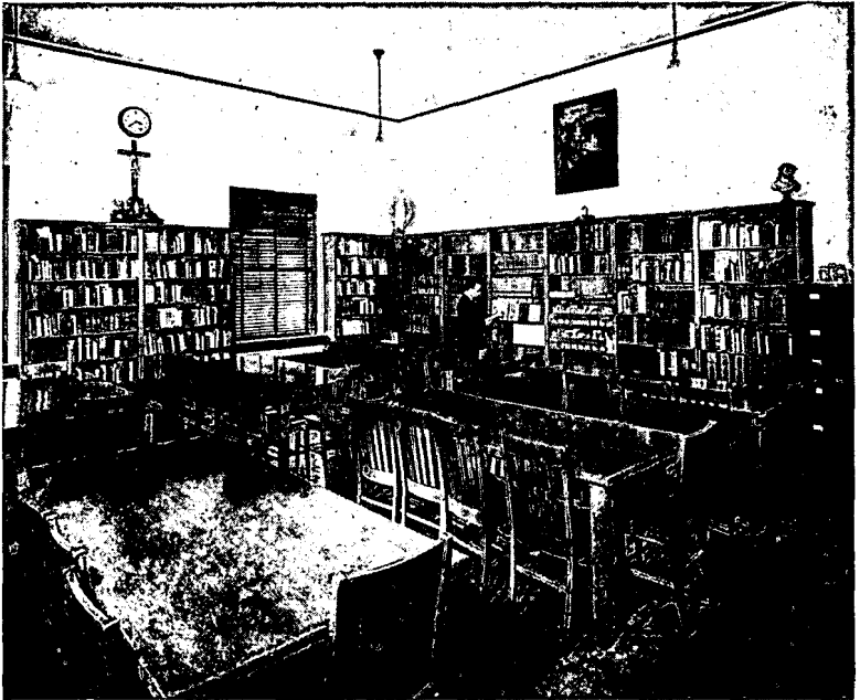
The Marian Library of University of Dayton, Dayton, Ohio— Showing a Marianist Checking for a Book