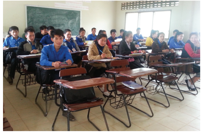
Classroom at Khang Khay Teacher Training College, Laos

The Department of Criminal Justice Studies continues its legacy of finding innovative and cutting-edge ways to provide competitive opportunities for students to explore and prepare for the Minnesota marketplace and beyond.