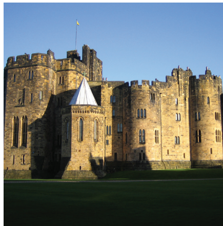
Alnwick Castle, a.k.a. the Harry Potter castle is the home away from home for SCSU students studying abroad.

The curriculum themes include: British culture, society and landscape; environmental ethics; ancient religions; and Harry Potter. Yes, Harry Potter! Not only is Alnwick Castle where the scenes for the first Harry Potter film were filmed. One of the courses offered will be "The Philosophy of Harry Potter." Students can also earn credits toward the British Studies minor. Application deadline: Feb. 1.