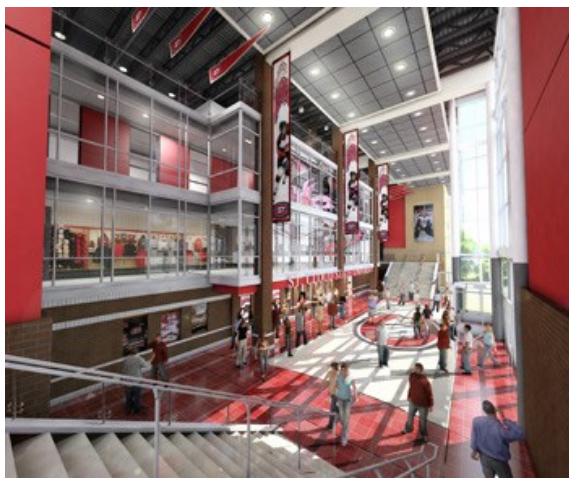
Architect drawing of the atrium of the Herb Brooks National Hockey Center