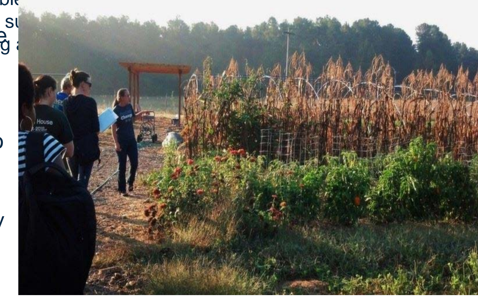
Figure 1. View of Duke University's on campus garden .

students with an on campus garden while also being able systainability efforts. 84% of students who answered a si Many schools like Furman University and Duke demonstrated interest in an on campus garden showing a bloskersity staven already implemented an on campus farm/garden. Both of these schools use a plot of land no bigger than 1 acre, while the University of Richmond has the potential to expand its current community garden up to 4 acres. Duke University uses classes and community programs like the CSA (Community Supported Agriculture) to maintain their gardens while also using them for experiential learning opportunities (Figure 1).