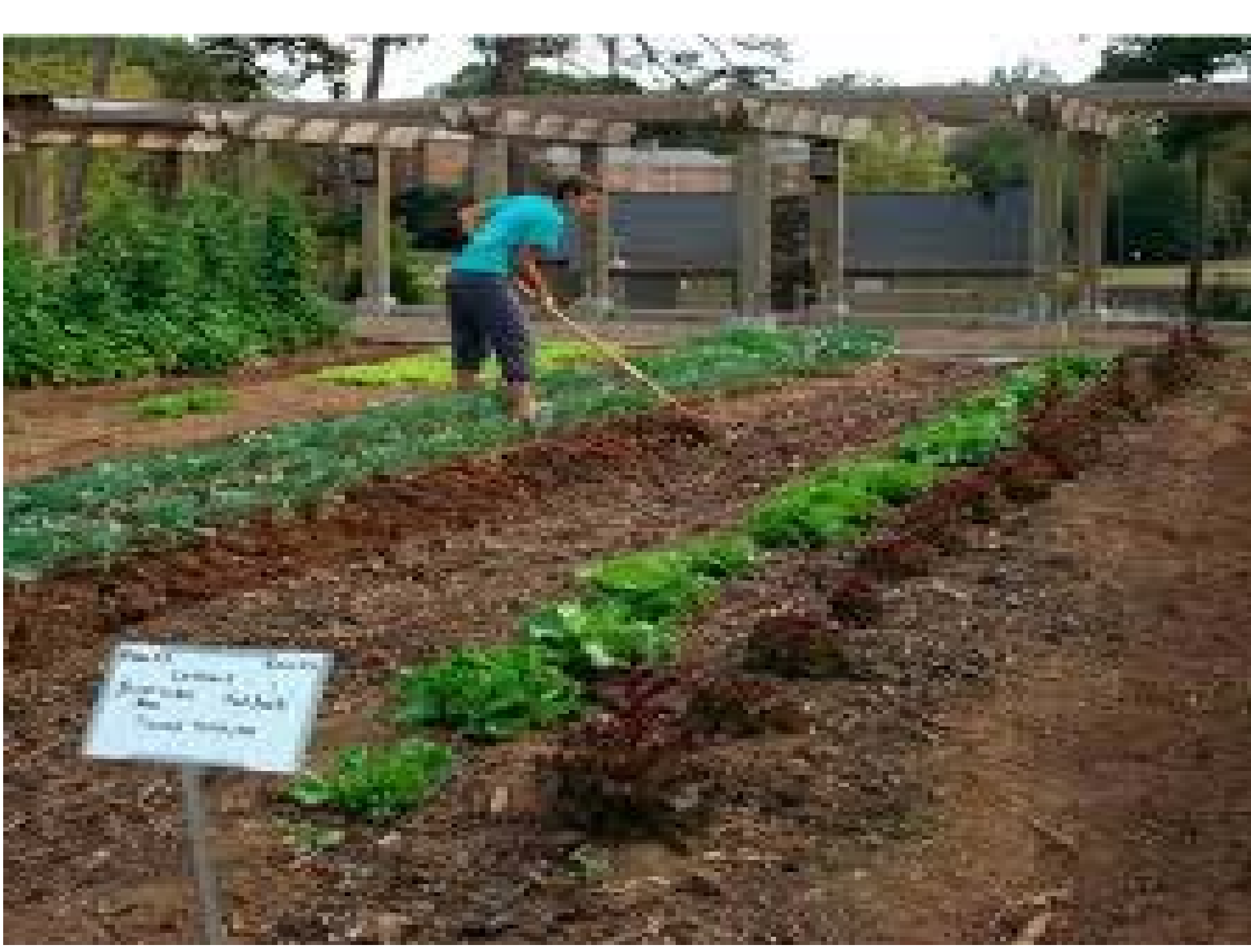
Figure 3. Furman University's on campus garden.